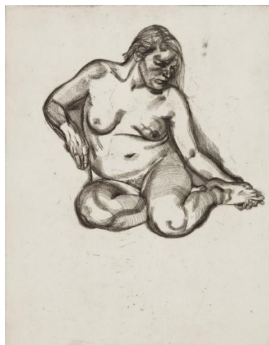
Lucian Freud 1922-2011 Girl Holding her Foot , 1985 Estimate: £20,000 - 30,000