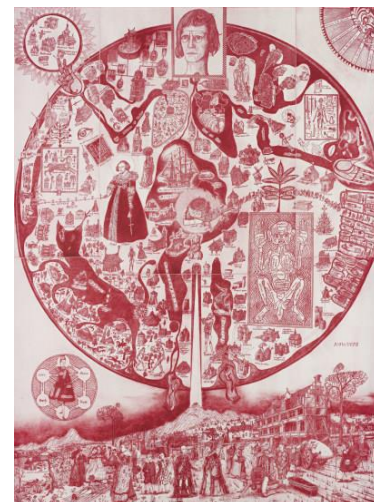
Grayson Perry b.1960 Map of Nowhere , 2008 Estimate: £18,000 - 20,000

Auction: Thursday, 7 June 2018, 2pm and 6.30pm Auction viewing: 31 May - 7 June Location: 30 Berkeley Square, London Click here for more information.