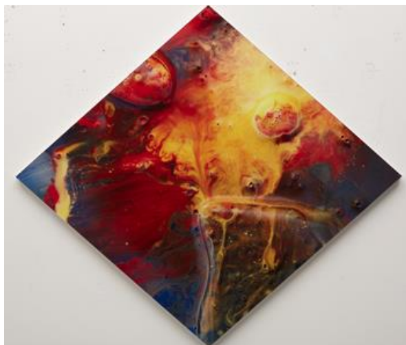
Gerhard Richter b. 1932 Guldenstern , 1998 Estimate: £15,000 - 20,000