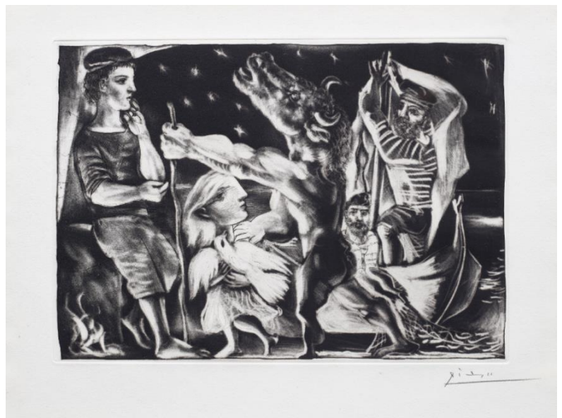
Pablo Picasso 1881-1973 Blind Minotaur led by a little Girl in the Night , 1934 Estimate: £60,000 - 80,000

A further highlight is Pablo Picasso’s Blind Minotaur led by a little Girl in the Night , from the Vollard Suite (estimate: £60,000 - £80,000, illustrated right ). The Minotaur first appeared in a charcoal drawing in 1928 (Centre Pompidou, Paris), but it was only in 1933 that Picasso focused his attention on the mythic beast in a group of etchings in the Vollard Suite. At the time, Picasso was embroiled in a passionate affair with the young Marie-Thérèse Walter, who is the current focus of a major exhibition at Tate Modern. This work is an extraordinary example of Picasso’s facility with printmaking. Picasso achieved the surreal effect through burnished aquatint, a method similar to mezzotint, in which the artist worked from dark to light.