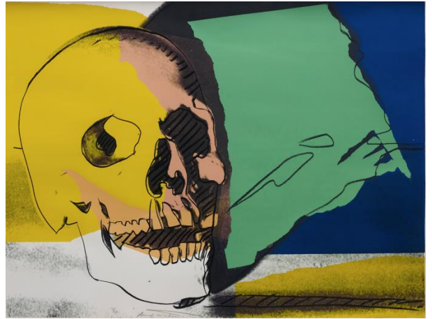
Andy Warhol 1928-1987 Skulls , 1976 Estimate: £60,000 - 80,000

The Evening Sale also includes Andy Warhol's iconic set of Skulls , executed in 1976 (estimate: £60,000 - 80,000, illustrated right ). The skulls perfectly demonstrate the artist's ability to manipulate and appropriate imagery to create a visual icon.