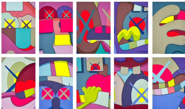
KAWS b. 1974 Ups and Downs , 2013 Estimate: £20,000 - 30,000

Illustrating the back cover of the sale catalogue is a detail of Grayson Perry's Map of Nowhere , 2008 (estimate: £18,000 - 20,000, illustrated below right ). Based on the 14th century Mappa Mundi , Perry's signature style uses a combination of image and text to create a fascinatingly intricate and individualistic map that celebrates his signature world view.