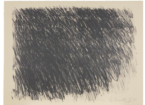
Cy Twombly 1928-2011 Untitled, 1971 Estimate: £300,000 - 400,000