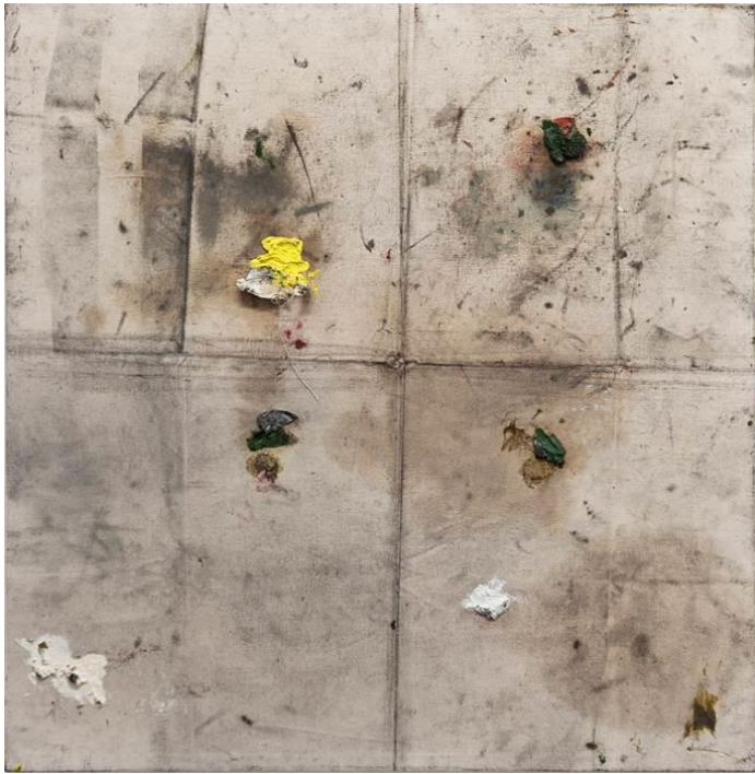
OSCAR MURILLO Untitled, 2011 Estimate £20,000 - 30,000