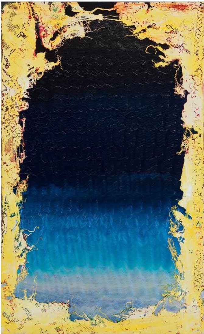
MARK FLOOD Manipulated Comic Book, 2009 Estimate £20,000 - 30,000