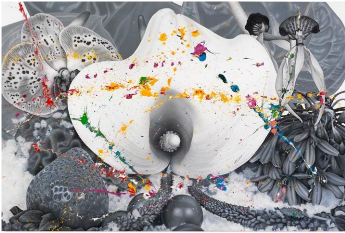
MARC QUINN Separation of Body and Soul, 2011 Estimate £80,000 - 120,000