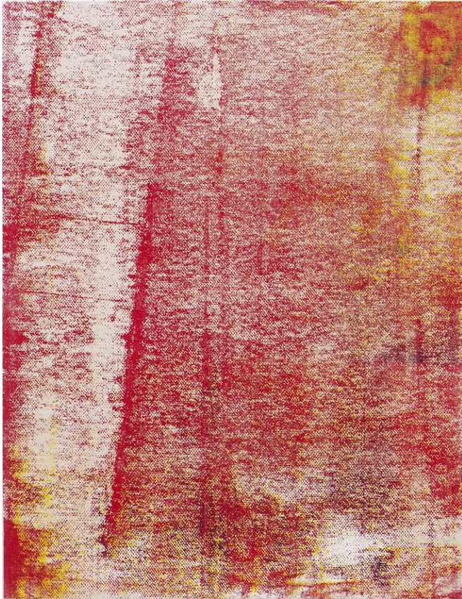
ISRAEL LUND Untitled 2, 2013 Estimate £20,000 - 30,000