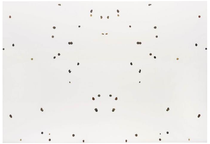
ADAM MCEWEN New York, New York, 2006 Estimate £30,000 - 50,000