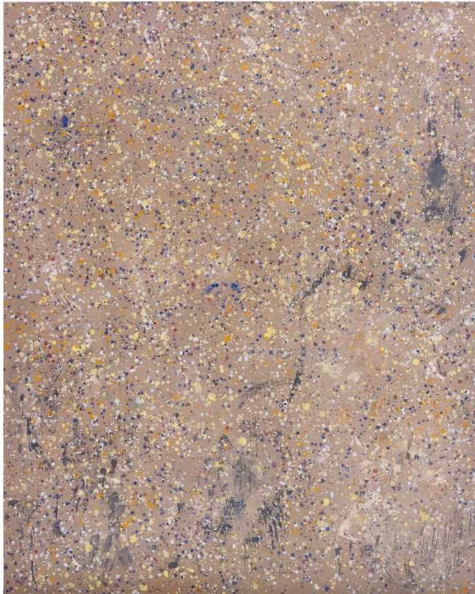
FREDERIK VAERSLEV Untitled (Terrazzo), 2011 Estimate £60,000 - 80,000

LONDON – 1 APRIL 2015 – Phillips is pleased to announce highlights from the Under the Influence Sale at 30 Berkeley Square. The auction, which presents a selection of important and young artist's will offer 189 lots, carrying a total pre-sale low estimate of £1.3 million / $1.9 million/ €1.8 million and a pre-sale high estimate of £1.9 million/$2.8 million/ €2.6 million.