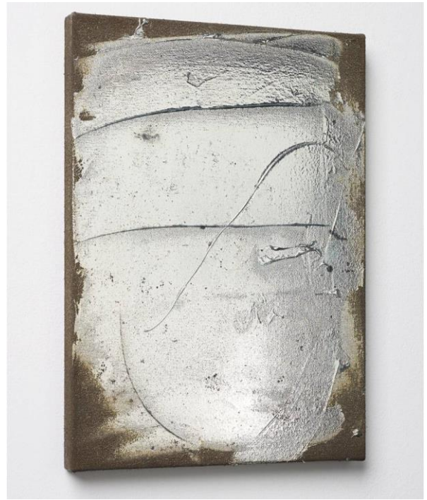
JACOB KASSAY Untitled, 2008 Estimate £15,000 - 20,000