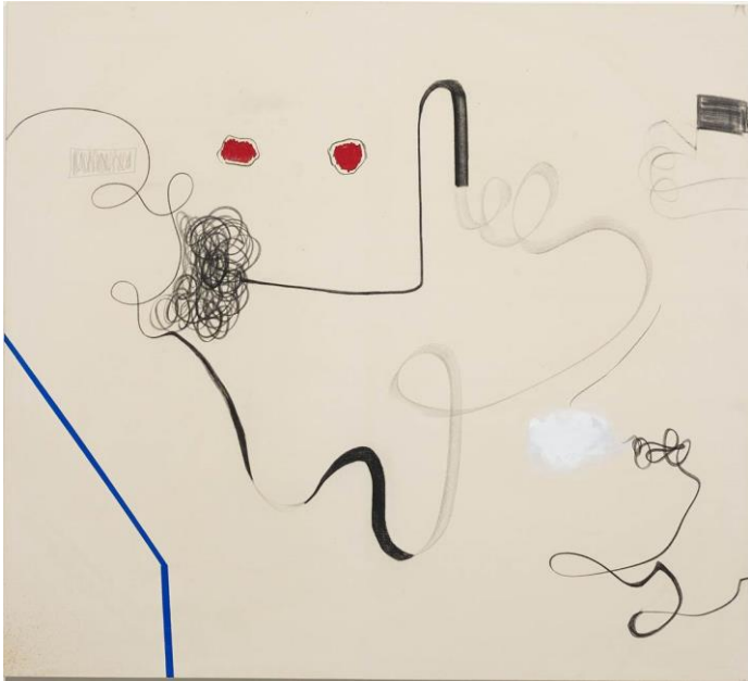
CHRISTIAN ROSA Untitled, 2014 Estimate £30,000 - 50,000