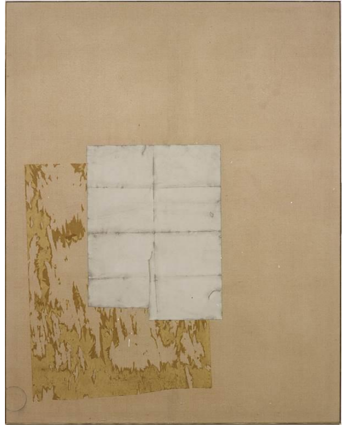
DAVID OSTROWSKI F (Deutscher Film in Russland), 2013 Estimate £20,000 - 30,000