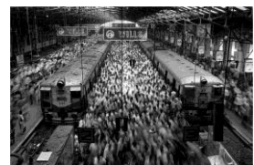
SEBASTIÃO SALGADO Churchgate Station Bombay, 1995