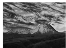
SEBASTIÃO SALGADO Kamen Volcano, Kamchatka