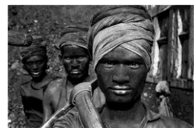
SEBASTIÃO SALGADO Dhanbad Bahir State India, 1989