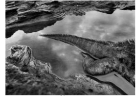
SEBASTIÃO SALGADO Marine iguana, Galápagos Ecuador, 2004

Sebastião Salgado was born in Brazil in 1944. After working as an economist he came to photography aged 29. Working initially as a photo-journalist, in the mid 1980's he became known as one of the world's leading photographers. In the last twenty five years he has devoted himself to producing three epic photographic essays: Workers published 1993 which examined the end of manual labour,