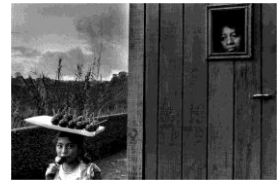
SEBASTIÃO SALGADO Outskirts of Guatemala City Guatemala, 1978