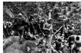
SEBASTIÃO SALGADO Goldmine, Serra Pelada Brazil, 1985