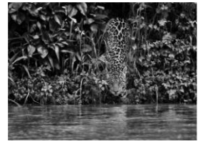
SEBASTIÃO SALGADO A jaguar (Panthera onca) Brazil, 2011