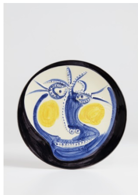
Pablo Picasso Visage (A.R. 448), 1960 Estimate: £8,000-12,000