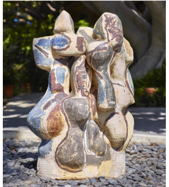
Peter Voulkos Rondena , 1958 Estimate: $300,000 - 500,000