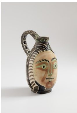
Pablo Picasso Femme du barbu (A.R. 193), 1953 Estimate: £15,000-20,000