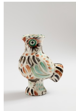
Pablo Picasso Chouette (A.R. 603), 1969 Estimate: £8,000-12,000