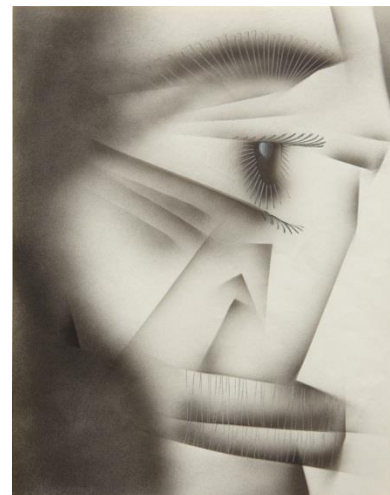
JIM SHAW Untitled, 1981 Estimate: £15,000 - 20,000