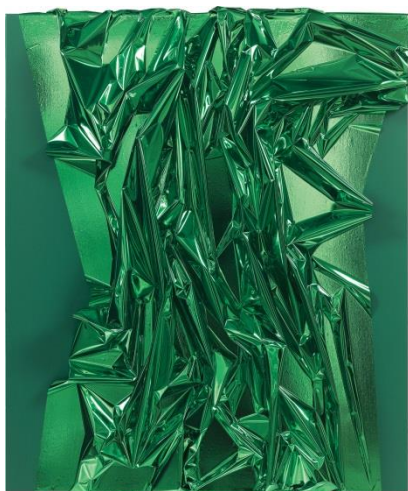
ANSELM REYLE Untitled, 2007 Estimate: £30,000 - 50,000

Inspired by the Pop aesthetics of Claes Oldenburg and Tom Wesselmann, and driven by his captivation with cartoon characters like Bugs Bunny and Mickey Mouse, KAWS emerged from the 1990s New York street art scene where he began his career creating 'forced collaborations' by employing advertisement found in public places. Upon his move to Tokyo, KAWS appropriated limited edition toys into his art, creating his own cast of characters, including Four Foot Dissected Companion .