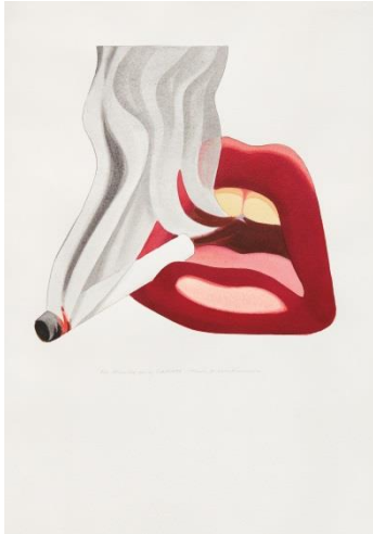
TOM WESSELMANN From Smoker #7, 1976 Estimate: £60,000 - 80,000