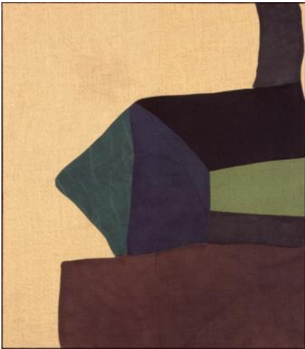
SERGEJ JENSEN Untitled , 2005 Estimate: £25,000 - 35,000