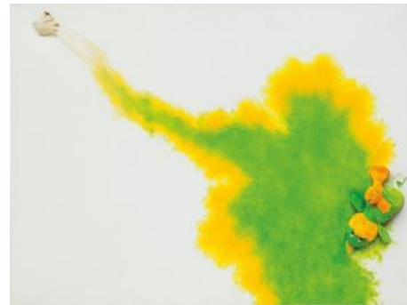
ROSTAN TAVASIEV Ugly Duckling , 2012 Estimate: £3,000 - 5,000

The New Now sale presents a selection of 11 works by former and current students of the Institute of Contemporary Art (ICA), Moscow. These works will be sold to raise money in support of the educational, research and publishing activities of the ICA. Since it was founded in 1991, the ICA created a space for experiment and discussion in the turmoil of the Post-Soviet reality. Artists represented include Irina Korina, emerging artist Ustina Yakovleva, and Rostan Tavasiev (estimate: £3,000 - £5,000, illustrated right ).