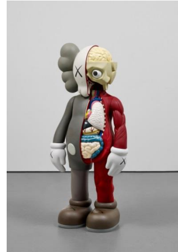
KAWS Four Foot Dissected Companion, 2009 Estimate: £12,000 - 18,000

Depicting velvety red lips exhaling smoke, From Smoker#7 demonstrates Tom Wesselmann's striking virtuosity in manipulating basic and familiar images into abstract and unsettling ones. In the Smokers series, developed from the late '60s as an outgrowth of the Nudes and continued through to the early '70's, Wesselmann shifts his focus on to one specific part of the woman's body, thus emphasising the element of fetishism present in his oeuvre since the earlier works.