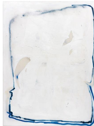
DAVID OSTROWSKI F (A Thing Is A Thing A Whole Which It's Not) , 2012 Estimate: £30,000 - 50,000

The New Now sale presents a selection of 11 works by former and current students of the Institute of Contemporary Art (ICA), Moscow. These works will be sold to raise money in support of the educational, research and publishing activities of the ICA. Since it was founded in 1991, the ICA created a space for experiment and discussion in the turmoil of the Post-Soviet reality. Artists represented include Irina Korina, emerging artist Ustina Yakovleva, and Rostan Tavasiev (estimate: £3,000 - £5,000, illustrated right ).