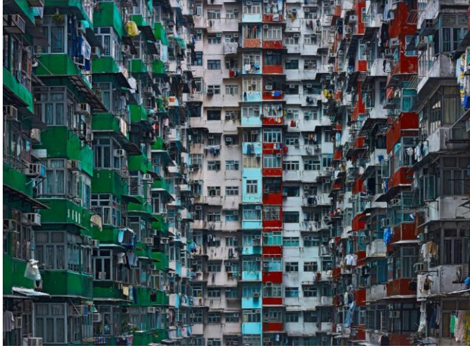
Michael Wolf Architecture of Density #119, 2005 Estimate: £15,000-20,000