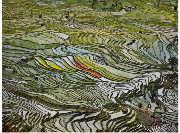
Edward Burtynsky Rice Terraces #2, Western Yunnan Province, China, 2012 Estimate: £10,000-15,000