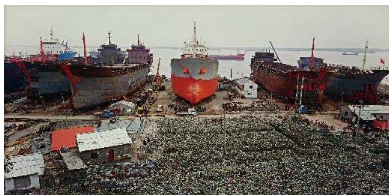
Edward Burtynsky Shipyard #1, Qili Port, Zhejiang Province, China , 2004 Estimate $25,000 - 35,000

Among over forty lots on offer in this dedicated single-owner section of the auction are additional works by classic and contemporary masters alike, including three Polaroids by Helmut Newton, ranging from $8,000-12,000 up to $20,000-30,000 (one illustrated page 3), two prints by Robert Polidori from his Versailles series (one illustrated page 3), and three lots by Edward Burtynsky, who has devoted his career to documenting human impact upon the planet, including his impressively sized Shipyard #1, Qili Port, Zhejiang Province, China , 2014. Burtynsky approaches his subjects armed with in-depth research and then exploits photography's unique ability to capture extreme detail so that no aspect of his subject goes unrecorded. A master technician, Burtynsky produces large format prints, such as Shipyard , that contain more information than the human eye can process at once. Other photographers featured include Hiroshi Sugimoto, Brassai, Lisette Model, Nicholas Nixon, and many others.