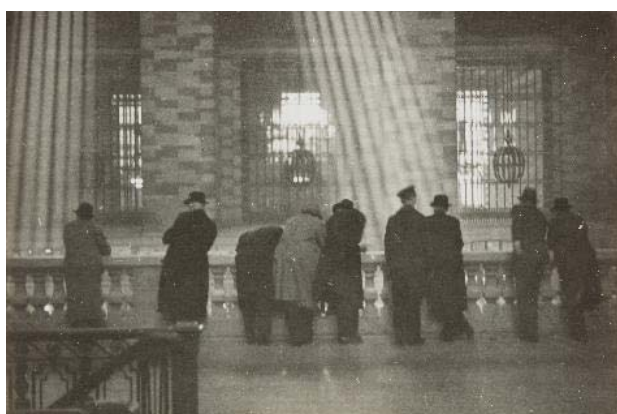
André Kertész The 1974 André Kertész Guggenheim Set , 1930s (One of ten illustrated) Estimate $40,000 - 60,000

Another unique group of prints in World View is the 1974 André Kertész Guggenheim Set , comprising ten photographs submitted by the photographer with his application for the prestigious John Simon Guggenheim Foundation Fellowship. On the strength of the images in this lot, Kertész was awarded the sum of $15,000 in 1974. The images were all taken shortly after his 1936 arrival in New York from Paris. This early New York work shows Kertész absorbing his new surroundings and performing the photographic alchemy that was uniquely his. Further classic highlights include a solarized Man Ray portrait (illustrated page 3) from his time in Los Angeles in the 1940s, and Edward Steichen's portrait of Joan Crawford, estimated at $20,000-30,000.