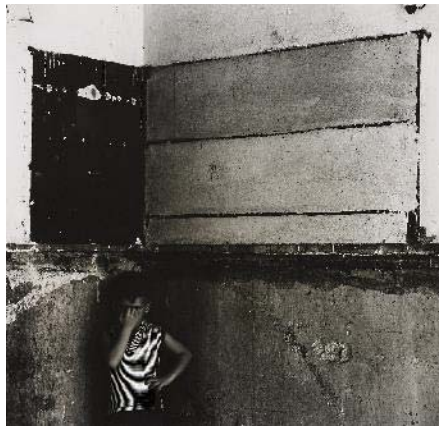
Ralph Eugene Meatyard Untitled (Flag, derelict interior with Christopher) , 1960 Estimate: $20,000 - 30,000