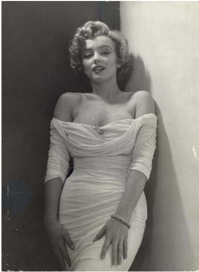
Phillipe Halsman Marilyn Monroe , 1952 Estimate $15,000 - 25,000