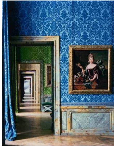
Robert Polidori Anne Louise Bénédicte de Bourbon, Duchesse du Maine, Attributed to Francois de Troy, Salle Les Princesses Royales (86) and ANR.02.004, Salles du XVII, Aile du Nord, 1er Etage, Versailles , 1984 Estimate $20,000 - 30,000