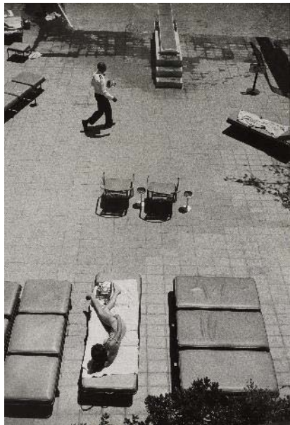
Garry Winogrand Los Angeles, California , 1964 Estimate: $20,000 - 30,000