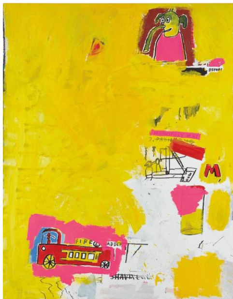
Jean-Michel Basquiat Pink Elephant with Fire Engine , 1984 Estimate £3,000,000-4,000,000