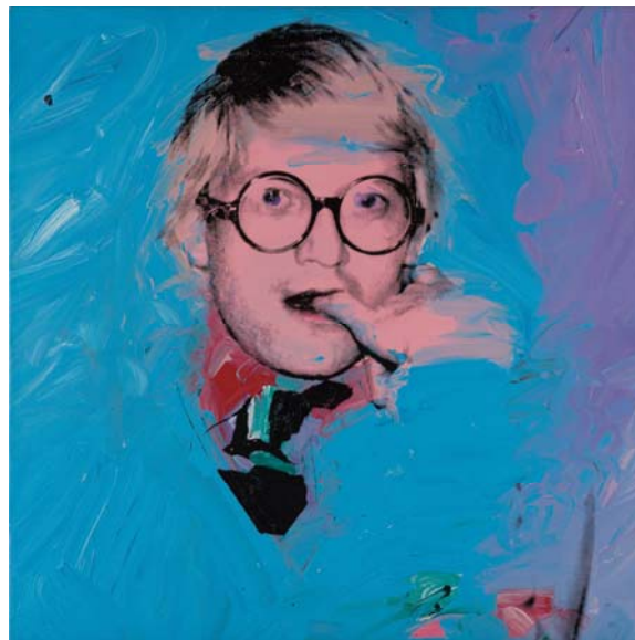
Andy Warhol David Hockney , 1974 Estimate: $400,000-600,000