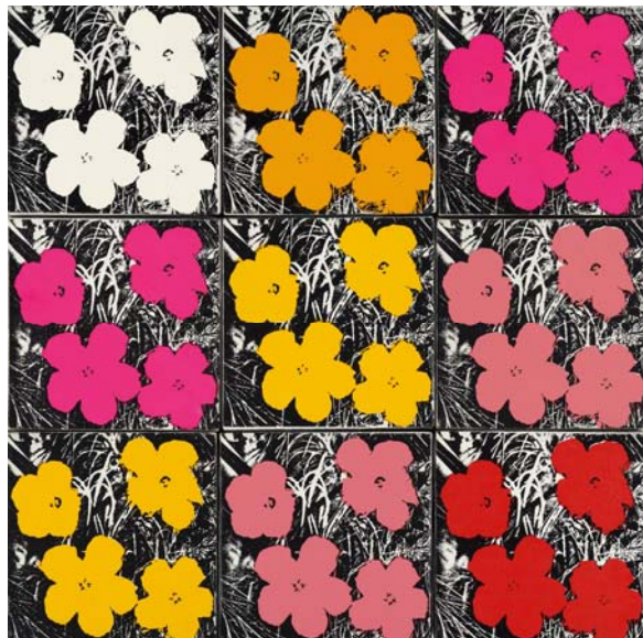
Andy Warhol 9 Flowers , 1965 Estimate: $3-4 million