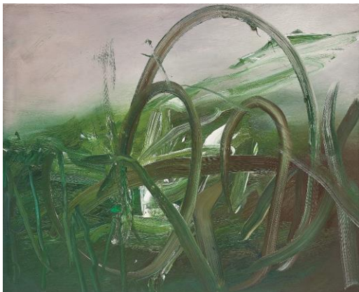
Gerhard Richter Busch , 1985

Leading the Karshan Collection is Gerhard Richter's Hände , (illustrated page one), which will be offered in the October Evening Sale of 20th Century & Contemporary Art in London. Painted in 1963, this oil on canvas is a striking early epitome of the artist's iconic and technically astute photo realist paintings of the 1960s. Between 1962 and 1968 Richter became concerned with pursuing a practice centered around photographic source imagery. This profound shift in practice and commencement of photo painting has had an overpowering effect on the history of contemporary painting. An intimate portrait, in Hände Richter presents the viewer with two blurred, unidentified hands. Considered one of the oldest motifs in the history of art, both as a central tool to creation and as a focus of representation, Richter confronts the onlooker with the most familiar of themes. Here, however, Richter projects the recognisable silhouette into a seemingly unreachable distance or illusion. Hände is a tremendously significant work, as it set Richter on a path of photo realist paintings, which became the core of his oeuvre.