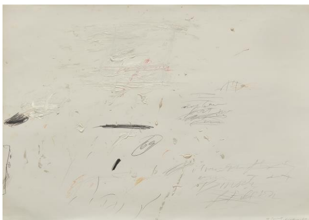
Cy Twombly Sperlonga drawing , 1959 Estimate: £350,000-550,000 To Be Offered in the London Evening Sale