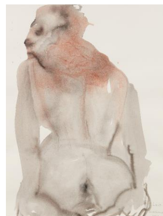
Marlene Dumas Leo , 2001 Estimate: £20,000-30,000 To Be Offered in the London Day Sale