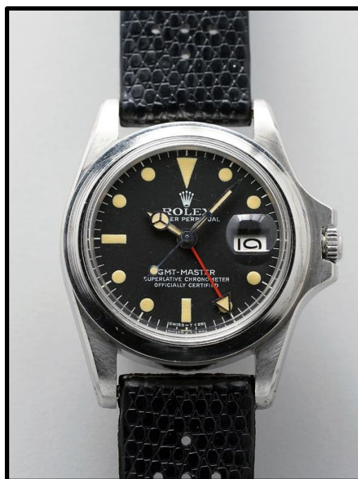
The Marlon Brando Apocalypse Now Rolex GMT-Master, ref. 1675