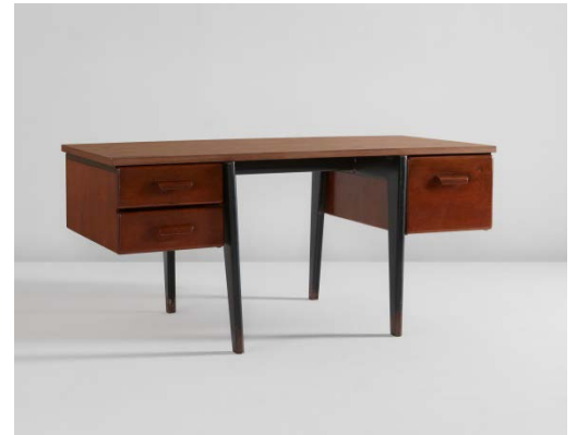
Jean Prouvé "Standard Desk" , 1942-1943 Estimate: $30,000-40,000

Leading the works of design in the September auction is Jean Prouvé's " Standard Desk ." A designer for the masses, Prouvé believed in design as a vehicle for improvement and collectors are drawn to his utilitarian,