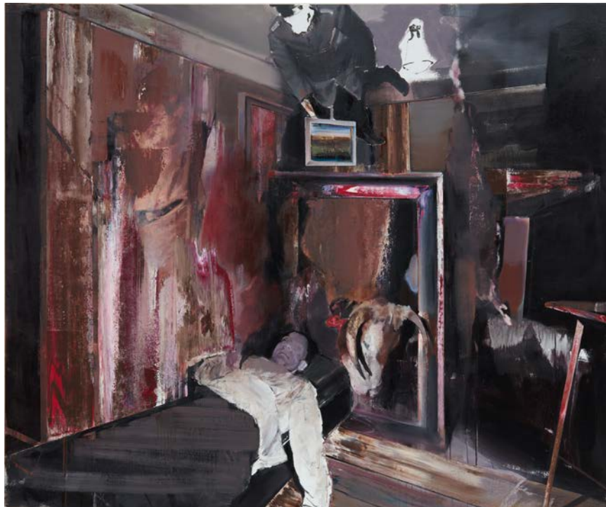
Adrian Ghenie The Collector 4

76 Lots to be Offered in a Dedicated Auction Alongside New York's September New Now Sale, with a Work by Adrian Ghenie to be Included in London's October Evening Sale of 20th Century & Contemporary Art