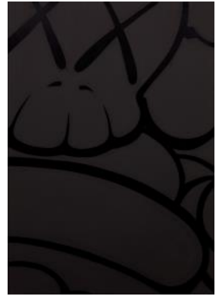
KAWS Untitled (BB2) , 2000 Estimate: $80,000-120,000

KAWS' large-sale Untitled (BB2) is also among the September highlights. The artist's signature style involves the reworking of many familiar icons often with X covered-eyes, such as Mickey Mouse, SpongeBob Square Pants and the Michelin Man, who is closely cropped yet still recognizable in the present work. The sinister motif of the X adopted by KAWS allows each of his cartoon characters to undergo a sardonic mutation, clearly evident here. Deftly operating at the intersection of street art and commercialism with a decidedly Pop sensibility, KAWS' body of work has become titanic in its own right. Painted in 2000, Untitled (BB2) is part of Katayama's extensive collection of fine art by KAWS, which includes sculptures, editions and numerous other paintings.