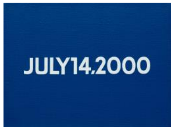
On Kawara Friday July 14, 2000 (Today series no. 26), 2000 Estimate: $220,000-280,000

Conceptual art has long fascinated Katayama, with him noting that his favorite conceptual artists, "have taught me to question, to believe, and they have furnished a magnificent humor that makes a difference to my life." Leading the auction on 19 September is On Kawara's July 14, 2000 from the critically acclaimed body of work collectively known as the Today Series . Begun on January 4, 1966, this series functions as a form of personal diary and travelogue for the artist as well as a reflection of the rapidly globalizing world. Each canvas is breathtakingly simple in its composition, the abbreviated date of the painting's execution is written in the language of the country in which it was conceived. The present work was painted on Friday, July 14, 2000 in New York City.