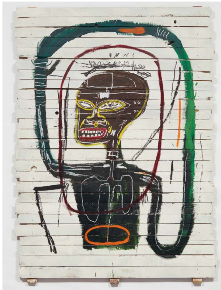
Jean-Michel Basquiat Flexible , 1984 Estimate on Request

Offered by The Artist's Estate, The Sale on 17 May Marks the Iconic Painting's First Time at Auction