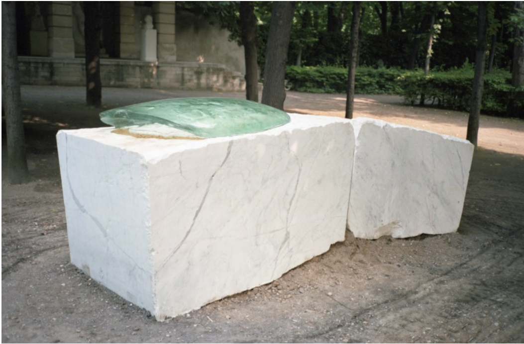
Giuseppe Penone b. 1947 Fingernail and Marble (Unghia e marmo) , 1988 Estimate: $150,000-250,000

Auction: Tuesday, 20 September 2016, 11am