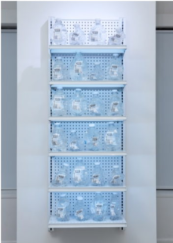
Josh Kline b. 1979 it's clean, it's natural, we promise. , 2011 Estimate: $12,000-18,000

The New Now auction will also be highlighted by Matt Connors' Untitled from 2015 (illustrated left). Nearly five feet in height, this impressive painting is the first major work from the Chicago-born artist to come to auction. Drawing upon the history of painting, Connors' works are rooted in the modernist canon, but occupy a uniquely contemporary territory in their method and concept. His wide-reaching practice also expands to installation-based works and artists' books. His works are held in major institutional collections including the Dallas Museum of Art, the Hammer Museum in Los Angeles, the Museum of Modern Art in New York, and the Walker Arts Center in Minneapolis.