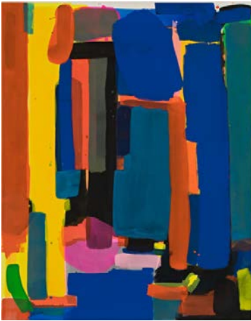
Matt Connors b. 1973 Untitled , 2015 Estimate: $30,000-40,000

Lawrence Weiner's language-based installation ASSUMING THE POSITION from 1989 (illustrated above) and Giuseppe Penone's monumental sculpture Fingernail and Marble (Unghia e marmo) from 1988 (illustrated page 3) both hail from his personal collection and are among the cornerstone pieces of the sale."