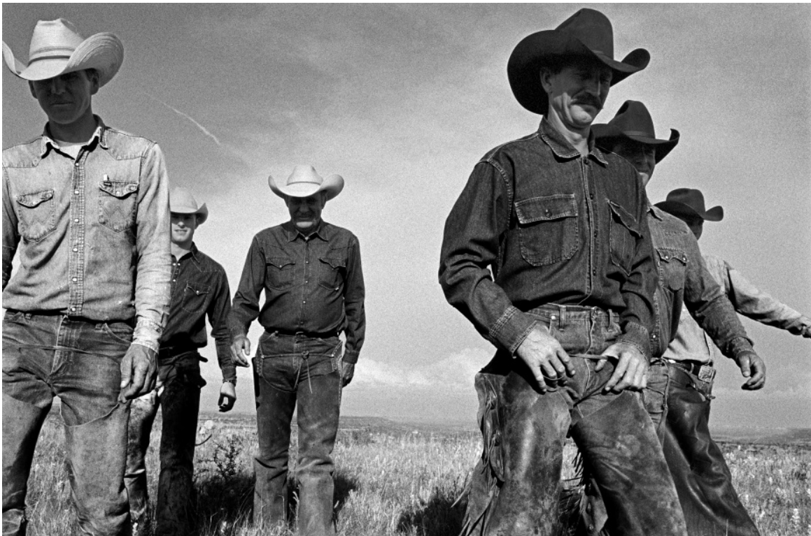
Cowboys Walking, J.R. Green Cattle Company, Shackelford County, Texas, May 13, 1997

Photographs Exhibition to be Held in New York from 3 January – 9 February