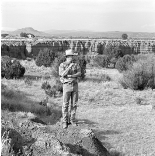
Bruce Nauman, Galisteo, New Mexico, May 26, 1998