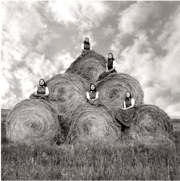
Hutterite girls during hay making season, Surprise Creek Colony Stanford, Montana, August 22, 1991