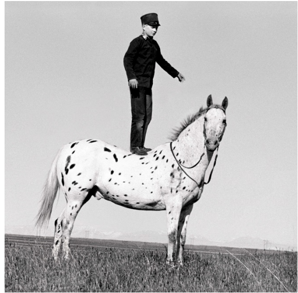
Hutterite Boy on Appaloosa, Golden Valley Colony Ryegate, Montana, June 15, 1993