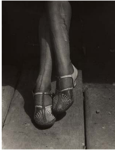
Dorothea Lange A Sign of the Times-Mended Stockings, Stenographer, San Francisco, 1934 Estimate: $18,000-22,000