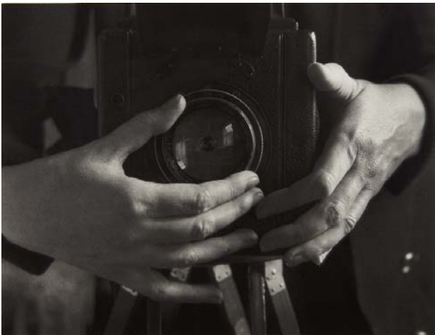
Alma Lavenson Self-Portrait, 1932 Estimate: $8,000-12,000

Women - both behind the camera and in front of it - have inspired great photography throughout the history of the medium. The photographs in the auction—by women and men alike—highlight these figures and celebrate every aspect of women's role in photography.