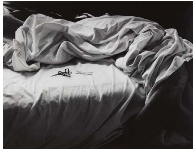
Imogen Cunningham The Unmade Bed, 1957 Estimate: $12,000-18,000