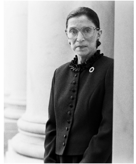
Michael O'Neill Ruth Bader Ginsburg, 1998 Estimate: $3,000-5,000