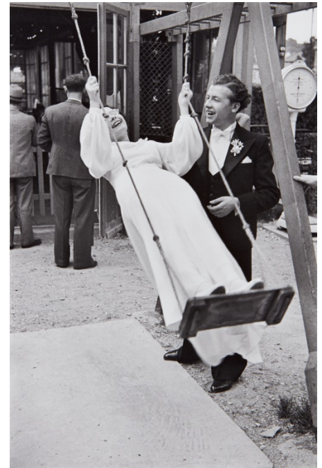
Joinville-le-Pont, France (A newly-wed bride and groom), 1938 Estimate: $6,000-8,000