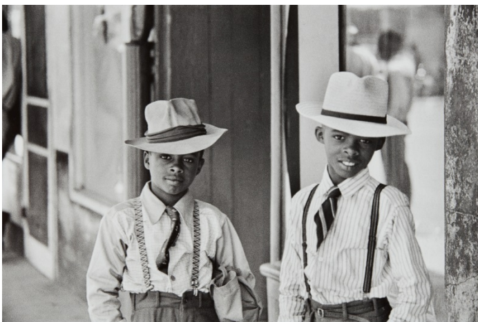
Natchez, Mississippi, 1947 Estimate: $10,000-15,000