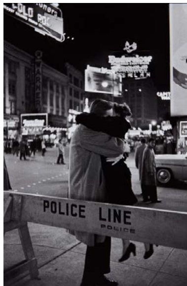
New Year's Eve, Times Square, Manhattan, New York, 1959 Estimate: $10,000-15,000