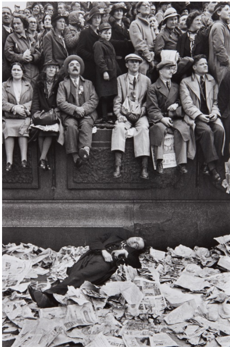
Coronation of King George VI, London, 1937 Estimate: $8,000-12,000