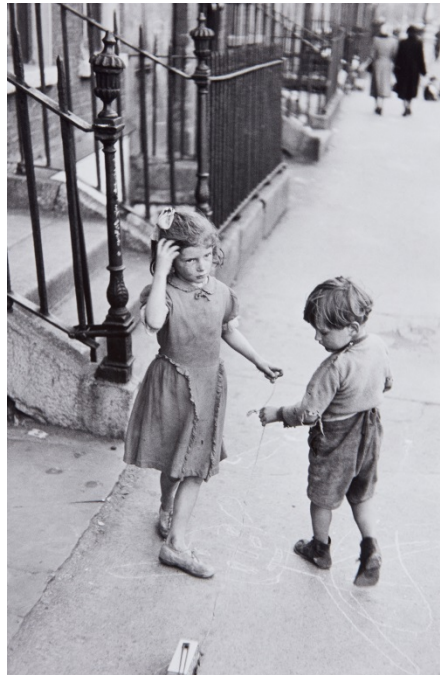
Dublin, Ireland, 1952 Estimate: $10,000-15,000