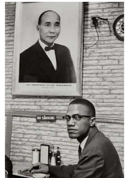
Malcolm X, 1961 Estimate: $7,000-9,000