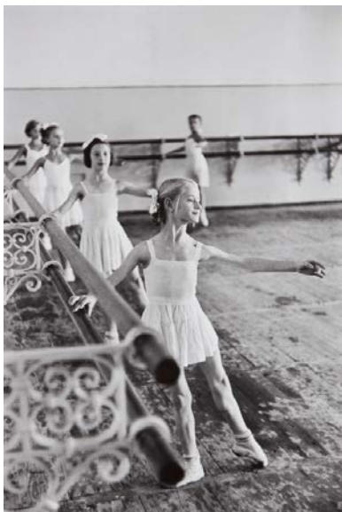
Bolshoi Ballet, Moscow, 1954 Estimate: $15,000-25,000