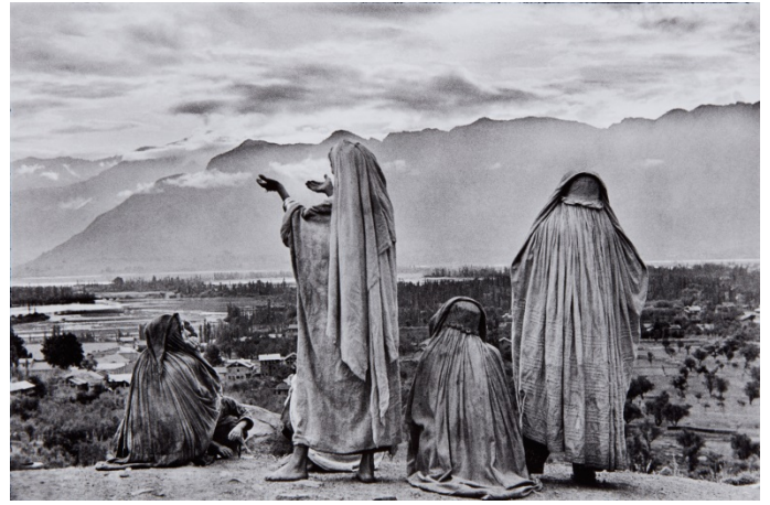
Srinagar, Kashmir, 1948 Estimate: $8,000-12,000