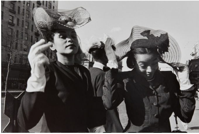
Easter Sunday, Harlem, 1947 Estimate: $7,000-9,000