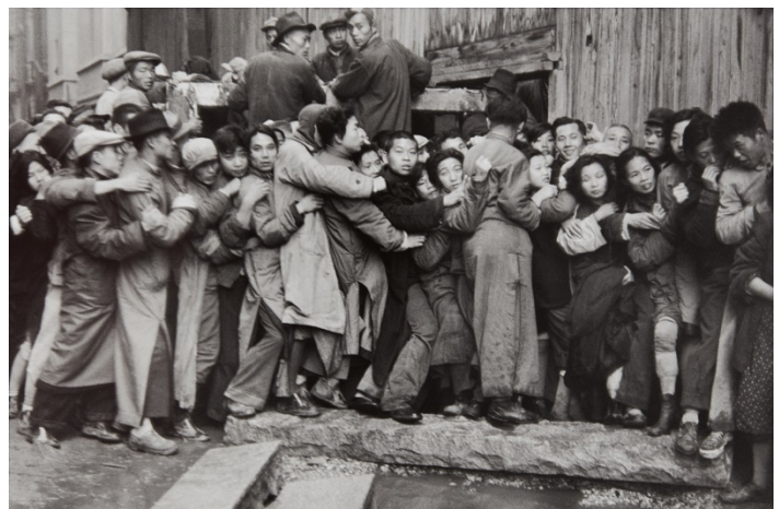
The Last Days of the Kuomintang [market crash], Shanghai, China, December 1948-January 1949 Estimate: $10,000-15,000