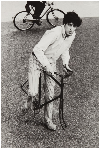
Lord Snowdon (Anthony Armstrong-Jones)

Terry O'Neill (b. 1938) has documented the great pop legends of the 20th century since the 1960s. He began shooting with a 35mm film camera that offered a distinctly candid and more casual approach to photography. With this camera, O'Neill was able to create photographs discreetly, candidly, and spontaneously, with less distance between him and his subjects. Works by O'Neill in this exhibition include photographs of Jean Shrimpton and Terence Stamp, Paul McCartney, and Brigitte Bardot.