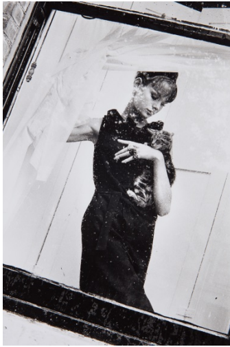
Jean Shrimpton, 1961