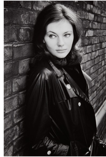
Jacqueline Bisset, Wilton Place, London, 1 May, 1964