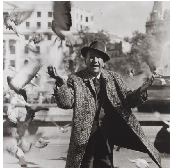
Lord Snowdon (Anthony Armstrong-Jones)

Noël Coward, Trafalgar Square, London, 1970