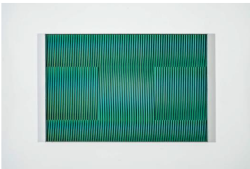
Carlos Cruz-Diez Venezuela b. 1923 Physichromie No. 951 , 1977 Estimate $120,000 - 180,000

Phillips is a leading global platform for buying and selling 20th and 21st Century art and design. With dedicated expertise in the areas of Art, Design, Photographs, Editions, Watches, and Jewelry, Phillips offers professional services and advice on all aspects of collecting. Auctions and exhibitions are held at salerooms in New York, London and Geneva, while clients are further served through representative offices based throughout Europe, the United States and Asia. Phillips also offers an online auction platform accessible anywhere in the world.