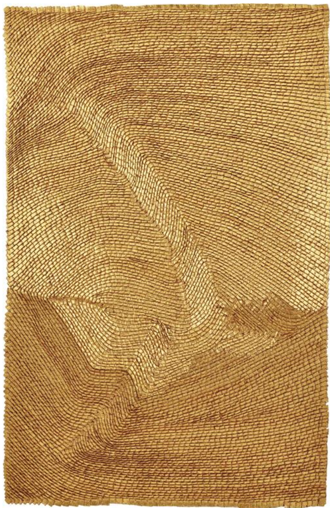
Olga de Amaral b. 1932 Colombia Umbra 53 , 2007 ESTIMATE $140,000 - 180,000