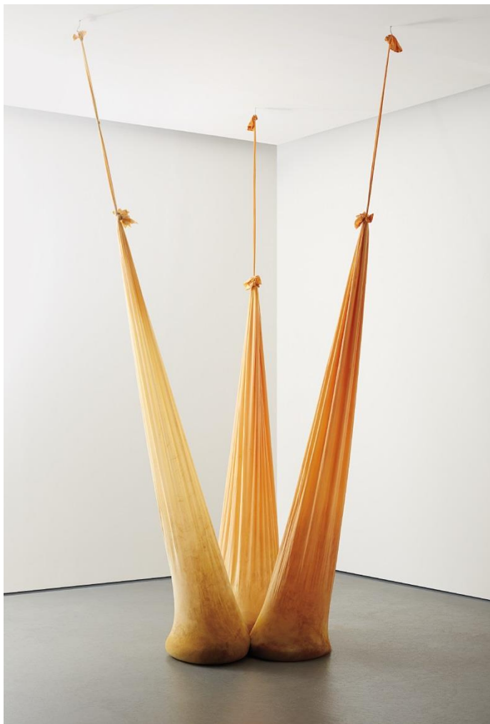
Ernesto Neto b. 1964 Brazil Quarks-Paff , 1998 ESTIMATE $40,000 - 60,000