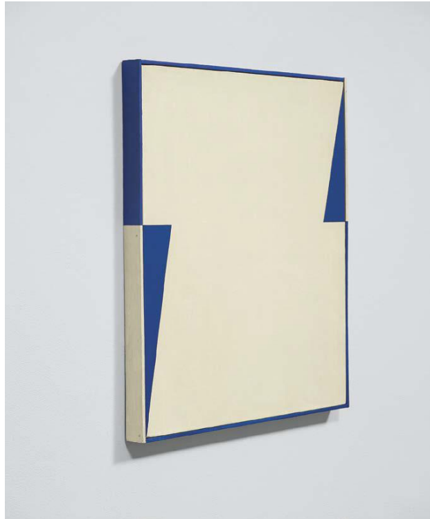
Carmen Herrera Cuba b. 1915 Basque , 1965 Estimate $120,000 - 180,000

FEATURING SEMINAL WORKS BY ARTISTS SUCH AS CARMEN HERRERA, ERNESTO NETO, GABRIEL OROZCO, AND CARLOS CRUZ-DIEZ