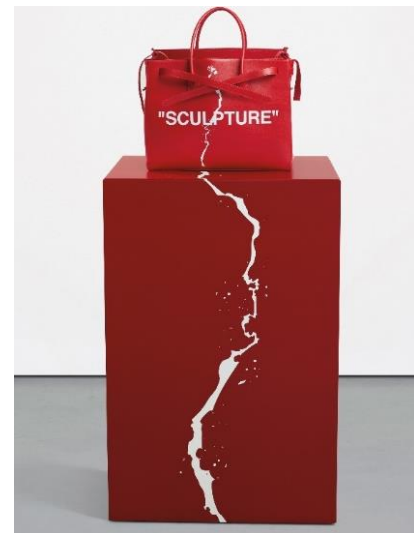
Takashi Murakami b. 1962 & Virgil Abloh b. 1980 "SCULPTURE" , 2018 HKD 100,000 - 150,000 / USD 12,800 - 19,200