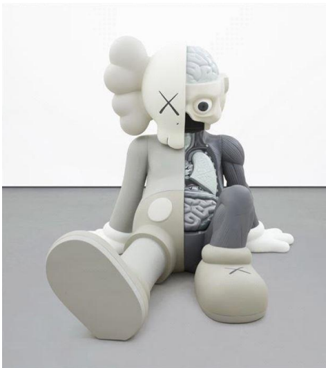
KAWS b. 1974 COMPANION (RESTING PLACE) , 2013 HKD 4.5 - 5.5 million / USD 577,000 - 705,000