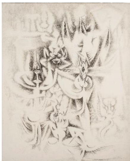
Wifredo Lam 1901-1982

Sur les Traces (also known as Transformation) , 1945 Estimate: HKD 12 – 16 million / USD 1.54 – 2.05 million