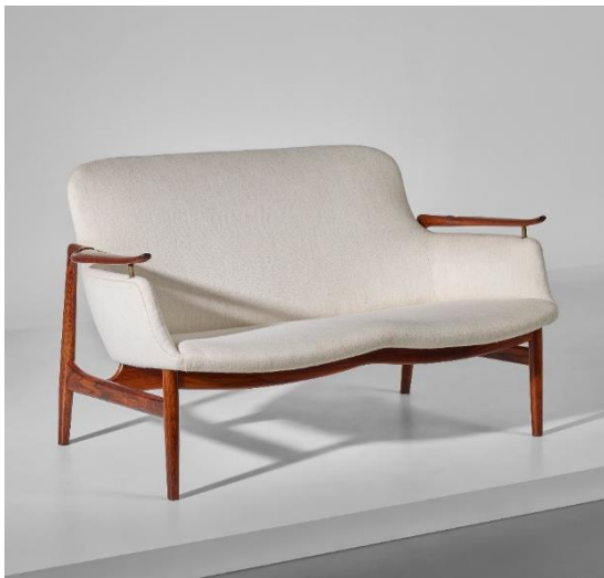
Finn Juhl 1912-1989

Hans J. Wegner 1914-2007 , Early 'Architect's desk', model no. JH 571 , circa 1955, HKD 200,000 - 300,000 / USD 25,600 - 38,500; Early swivel armchair, model no. JH502 , circa 1960s, HKD 150,000 - 250,000 / USD 19,200 - 32,100; Paavo Tynell 1890-1973 , Early table lamp, model no. 5061 , circa 1940s, HK$ 50,000-80,000 / US$ 6,400-10,300