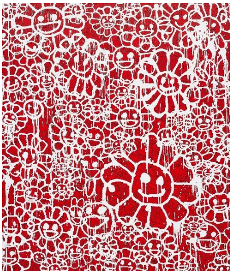
Takashi Murakami b. 1962 Flower collaboration with MADSAKI , 2017 HKD 2 - 3 million / USD 256,000 - 385,000