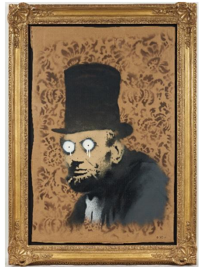
Banksy Abe Lincoln , 2008 HKD 1 - 2 million / USD 128,000 - 256,000

Phillips holds many of world auction records for KAWS, including the record for a sculpture by the artist. The present monumental sculpture, COMPANION (RESTING PLACE) , measures 152.4 x 160 x 203 cm (illustrated above, left). Provocatively half-dissected and rendered in a sophisticated grey-scale palette, this work monumentalises the beloved character created by Brian Donnelly, one of the most popular artists of his generation, who goes by the pseudonym KAWS. Implementing KAWS's signature logos, the "X" replaces one of the eyes, the protruding crossbones, though bisected, signal an ear or hair, while the playfully oversized features provide comedic relief to the underlying tones of existentialism. This work is one of the only few life-size grey sculptures completed during the final season of the artist's brand OriginalFake.