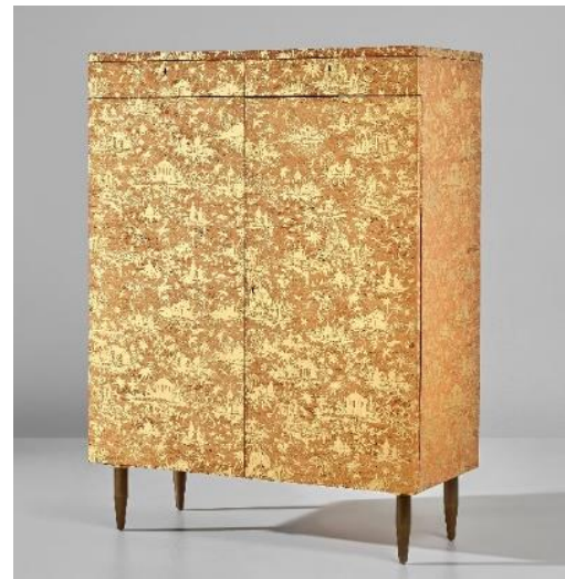
Piero Fornasetti 1913-1988

Two-seater sofa, model no. FJ 53 , designed 1953, produced 1950s HKD 120,000 - 220,000 / USD 15,400 - 28,200