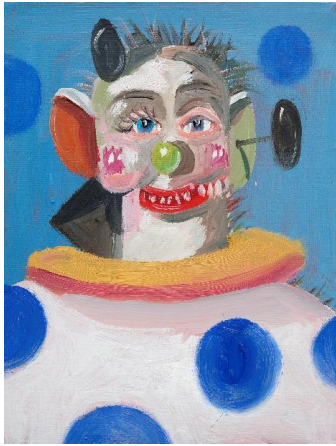
George Condo b. 1957 Son of Bozo , 2008-09

HKD 900,000 - 1.2 million / USD 115,000 - 154,000