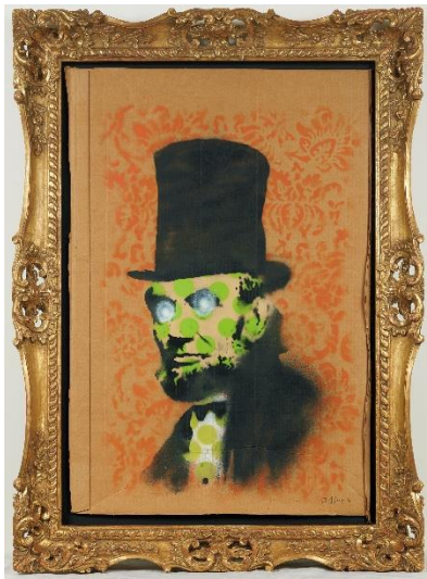
Banksy Abe Lincoln , 2008 HKD 1 - 2 million / USD 128,000 - 256,000