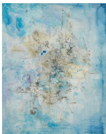
Zao Wou-Ki 1920-2013 Untitled , 1956

Works by other contemporary Japanese artists include Yayoi Kusama, Yoshitomo Nara, and Ayako Rokkaku.