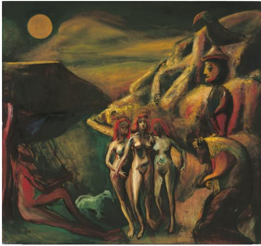
Yun Gee (Zhu Yuanzhi) 1906-1963 Three Graces , 1939 HKD 8 - 12 million / USD 1.03 - 1.54 million