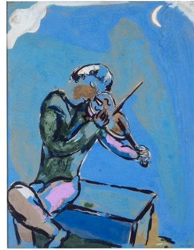
Marc Chagall 1887-1985 Le violoniste bleu , 1929 HKD 3.8 - 4.8 million / USD 487,000 - 615,000