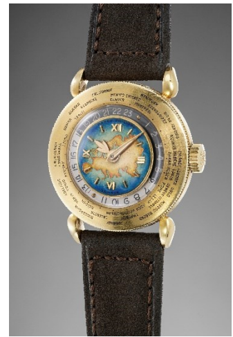
Patek Philippe World Time Reference 1415 with cloisonné enamel dial. Estimate: CHF 700,000 to 1,400,000