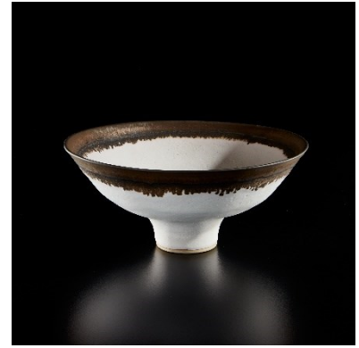
Lucie Rie Footed bowl, 1984 Estimate: $30,000 - 40,000