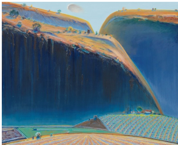
Wayne Thiebaud Valley Ranch, 2001

Reference 6265 in 18 karat white gold. Estimate: In excess of CHF 3,000,000