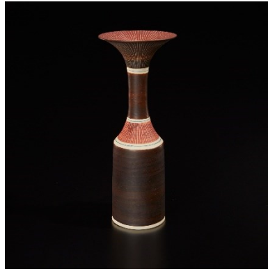
Lucie Rie Bottle with cylindrical body and flaring lip, 1970s Estimate: $20,000-30,000