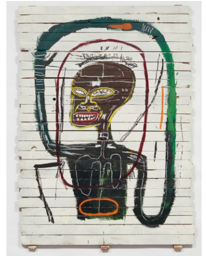
Jean-Michel Basquiat Flexible , 1984 Estimate on request

In addition to the works at The Apartment by The Line – Los Angeles, Phillips will also be exhibiting Jean-Michel Basquiat's Flexible just a short walk away at 8404 Melrose Ave. Consigned directly from the artist's estate, this sale marks the work's first time ever being offered for sale, publicly or privately. Estimated to sell in excess of $20 million, Flexible is the highest-value and largest work to ever have been offered from the Estate. It was executed in 1984, after Basquiat had just been catapulted from the New York underground scene on to international stardom. At the time of this work's creation, he was working in Venice, California, preparing for his second exhibition at Larry Gagosian Gallery in Los Angeles. For the full press release on this artwork, please click here .