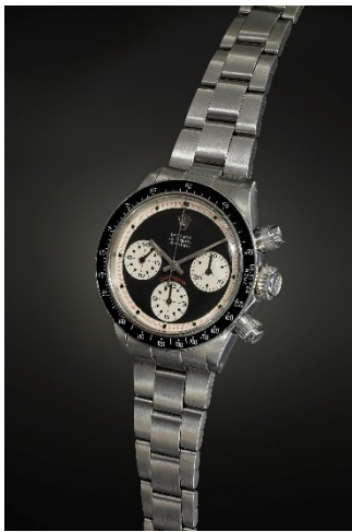
Rolex Cosmograph Daytona - "The Oyster Sotto" Reference 6263 in stainless steel. Estimate: CHF 1,000,000 to 2,000,000