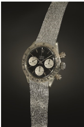
Rolex Cosmograph Daytona "The Unicorn"

Works of Design, Watches, and 20th Century & Contemporary Art to be On View to the Public from 10-13 April