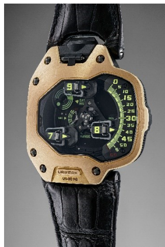
Urwerk reference UR-110RG - "Iron Man's Watch", Worn by Robert Downey Jr. in Spiderman: Homecoming . Estimate: CHF 50,000 to 100,000