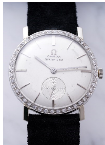
Omega "Elvis Presley" Watch, Retailed by Tiffany & Co., Estimate: CHF 50,000 to 100,000