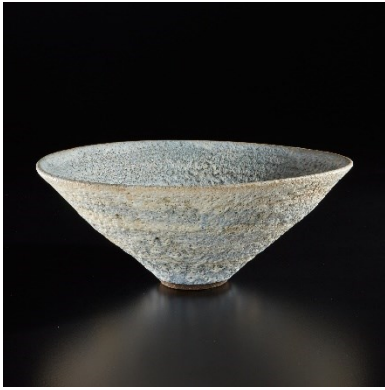
Lucie Rie Large conical bowl, circa 1980 Estimate: $20,000-30,000