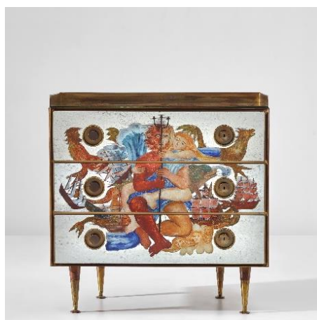
Gio Ponti and Edina Altara Chest of drawers, circa 1951 Estimate: £45,000 - 65,000