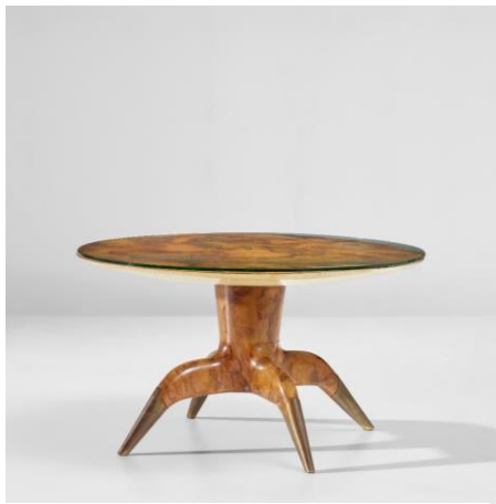
Gio Ponti Low table, circa 1951 Estimate: £15,000 - 20,000