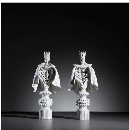
Gio Ponti Large king and queen statuettes, circa 1951 Estimate: £15,000 - 20,000

Featured amongst the highlighted lots designed for Casa Lucano are glazed earthenware ceramics, including the Large king and queen statuettes (estimate: £15,000-20,000), Two pistol-form sculptures (estimate: £4,000-6,000), and a Wall light with niche and hand with flowers statuette (estimate: £10,000-15,000). Selected furniture highlights from the sale include a Chest of drawers designed by Gio Ponti with painted mirrored glass by Edina Altara, circa 1951 (estimate: £45,000-65,000) and a burr walnut-veneered Low table designed by Gio Ponti, circa 1951 (estimate: £15,000-20,000)