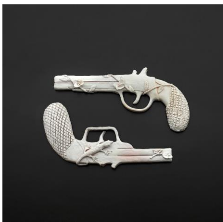
Gio Ponti Two pistol-form sculptures, circa 1951 Estimate: £4,000 - 6,000