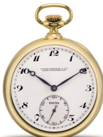
Patek Philippe's exceptional and highly important yellow gold open face one-minute tourbillon “Extra” pocket chronometer, with James C. Pellaton tourbillon carriage, recipient of the first class prize at the Geneva 1929 Observatory timing competition, and Honorable mention in 1931, made 1929. Estimate: HKD1 – 1.5 million / USD128,000 – 192,000