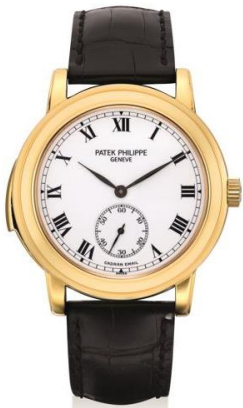
Patek Philippe Reference 5079J-001. An extremely fine, large, rare and elegant yellow gold "Cathedral" minute repeating wristwatch with enamel dial, box and certificate of origin, made 2004. Estimate: HKD2 - 4 million / USD256,000 - 513,000

Auction to take place at the Mandarin Oriental Hong Kong on 27 November 2018