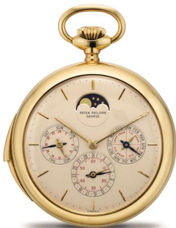
Patek Philippe Reference 880. A rare and attractive yellow gold minute repeating perpetual calendar open face pocket watch with moonphase and 24-hour indication, made 1986. Estimate: HKD560,000 – 960,000 / USD71,800 – 123,000

Even though wristwatches dominate the current international market place, collectors worldwide are also after complicated pocket watches, which serve as an excellent window to the traditional workmanship of a bygone era.