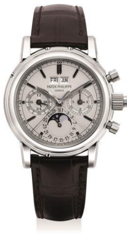
Patek Philippe Reference 5004A. An extremely rare and fine stainless steel perpetual calendar split seconds chronograph wristwatch with moon phases, 24 hours, leap year indicator, original certificate, additional case back and box, made circa 2013. Estimate: HKD3.2 - 5 million / USD410,000 - 641,000