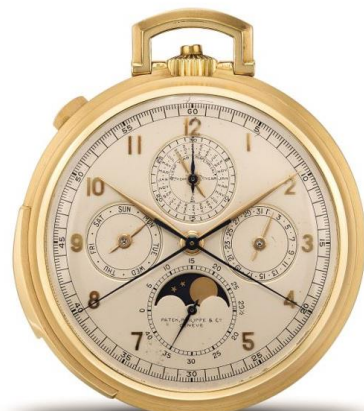
Patek Philippe Reference 658. A very rare and fine yellow gold minute repeating perpetual calendar open face split-seconds chronograph pocket watch with moonphase, made 1930. Estimate: HKD1.2 – 2 million / USD154,000 – 256,000