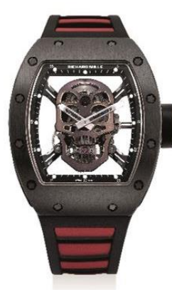
Richard Mille “RM52-01” “Skull”. A highly attractive and rare limited edition titanium, pink gold and ceramic skeletonized tonneau-shaped wristwatch with tourbillon, original certificate and box, numbered 6 of a limited edition of 6 pieces, manufactured 2013. Estimate: HKD4.8 – 6 million / USD615,000 – 769,000