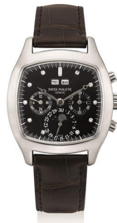
Patek Philippe Reference 5020P. An extremely rare and outstanding platinum perpetual calendar chronograph wristwatch with moon phases, additional silvered dial with Breguet numerals, original certificate, setting pin and presentation box, made 2000. Estimate: HKD1.8 - 4 million / USD230,000 - 513,000