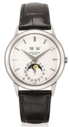
Patek Philippe Reference 3448. A very fine and rare white gold perpetual calendar wristwatch with moon phases and inverted date numerals, made circa 1971. Estimate: HKD1.6 - 3.2 million / USD205,000 - 410,000

HONG KONG - 23 October 2018 - Phillips in association with Bacs & Russo is pleased to announce the Hong Kong Watch Auction: SEVEN , which will be held on 27 November 2018 at the Mandarin Oriental Hong Kong. Comprising over 250 lots, the tightly curated sale will offer a meticulous selection of fine, collectable timepieces in excellent condition, all manufactured by the world's most renowned watchmakers. Modern and vintage wristwatches, fine pocket watches and enamel clocks, including a line-up of fresh-to-the-market examples, will be on offer.