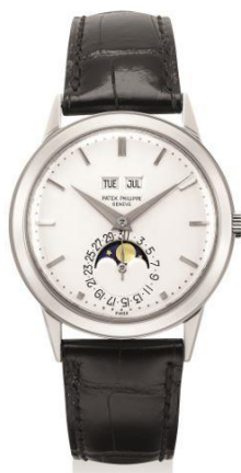
Patek Philippe Reference 3448. A very fine and rare white gold perpetual calendar wristwatch with moon phases and inverted date numerals, made circa 1971. Estimate: HKD1.6 - 3.2 million / USD205,000 - 410,000