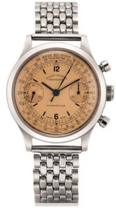
Rolex Reference 3525. An extremely rare and highly attractive stainless steel chronograph wristwatch with salmon dial, tachymeter, telemeter scales and bracelet, made circa 1945. Estimate: HKD630,000 – 940,000 / USD80,800 – 121,000