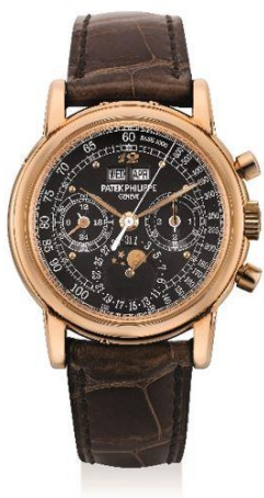
Patek Philippe Reference 3970ER-028. An extremely rare and highly attractive pink gold perpetual calendar chronograph wristwatch with black dial and Breguet numeral at the 12 o'clock, tachymeter scale, Certificate of Origin, presentation box and additional hard back, made 2015. Estimate: HKD1.6 - 3 million / USD205,000 - 385,000