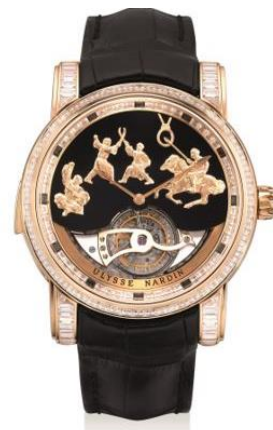
Ulysse Nardin Reference 786-81. An extremely fine and very rare limited edition pink gold and baguette diamond-set Westminster minute repeating wristwatch with carillon tourbillon, Jaquemarts, Certificate and box, numbered 10 of a limited edition of 30 pieces, made circa 2018. Estimate: HKD3.5 – 4.5 million / USD449,000 – 577,000