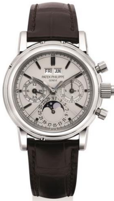
Patek Philippe Reference 5004A. An extremely rare and fine stainless steel perpetual calendar split seconds chronograph wristwatch with moon phases, 24 hours, leap year indicator, certificate of origin, additional case back and box, made circa 2013. Estimate: HKD3.2 - 5 million / USD410,000 - 641,000