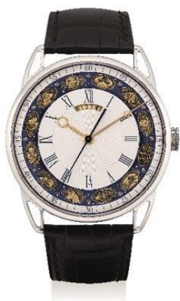
De Bethune Reference DB25T. A very fine and rare limited edition white gold wristwatch with tourbillon, dead beat seconds and guilloché dial, numbered 4 of a limited edition of 20 pieces, made circa 2015. Estimate: HKD620,000 – 950,000 / USD79,500 – 122,000

This is the first time for a Richard Mille “RM52” “Skull” – especially manufactured for the Asia market - and Ulysse Nardine’s bejewelled Genghis Khan model to be offered at auction. In excellent condition, a rare and exceptional Greubel Forsey platinum double tourbillon wristwatch will also make its debut appearance at auction. De Bethune’s DB25T and DB28T from the private collection of the manufacturer’s founder are notable lots that cannot be missed.