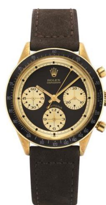
Rolex Reference 6241 "John Player Special". A highly attractive and rare yellow gold chronograph wristwatch with black "Paul Newman" dial displaying contrasting gold registers, made circa 1968. Estimate: HKD3.9 - 7.8 million / USD500,000 - 1 million