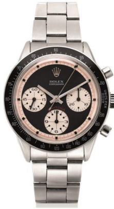
Rolex Reference 6241. A rare, very well-preserved and attractive stainless steel chronograph wristwatch with black “Paul Newman” dial, bracelet and guarantee, made circa 1968. Estimate: HKD1.2 – 2.4 million / USD154,000 – 308,000