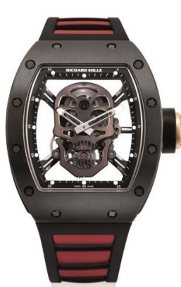
Richard Mille "RM52-01" "Skull". A highly attractive and rare limited edition titanium, pink gold and ceramic skeletonized tonneau-shaped wristwatch with tourbillon, original certificate and box, numbered 6 of a limited edition of 6 pieces for the Asia market, manufactured 2013. Estimate: HKD4.8 - 6 million / USD615,000 - 769,000