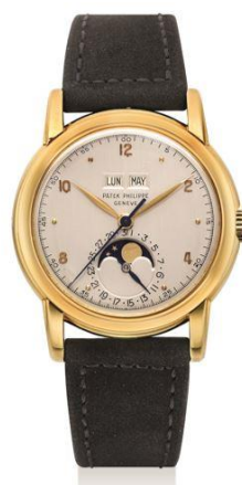
Patek Philippe Reference 2497. A very rare and highly attractive yellow gold perpetual calendar wristwatch with moon phase, center seconds and Spanish calendar, made 1953. Estimate: HKD1.2 - 2.4 million / USD154,000 - 308,000