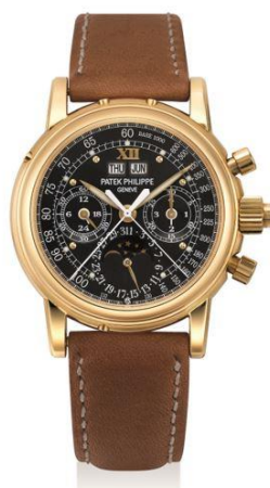
Patek Philippe Reference 5004J-027. A possibly unique and important yellow gold perpetual calendar split seconds chronograph wristwatch with moon phases, leap year, special luminous monogram dial, original certificate, additional case back, setting pin and fitted presentation box, made 2008. Estimate: HKD2.5 - 4 million / USD321,000 - 513,000