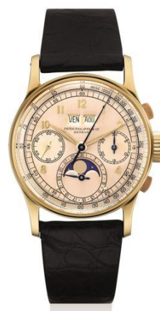
Patek Philippe Reference 1518. An important, rare and attractive yellow gold perpetual calendar chronograph with moon phases, made 1944. Estimate: HKD1.6 - 3.2 million / USD205,000 - 410,000