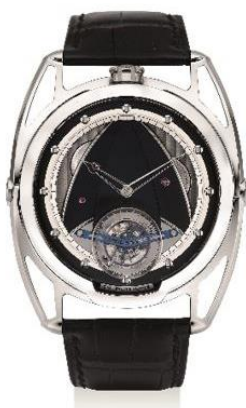
De Bethune Reference DB28T. A fine and rare titanium wristwatch with tourbillon and power reserve, numbered 30, made circa 2011. Estimate: HKD470,000 – 700,000 / USD60,300 – 89,700