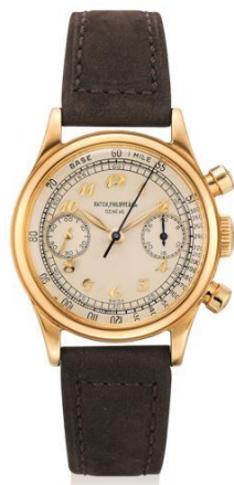
Patek Philippe Reference 1463. A very rare and highly attractive yellow gold chronograph wristwatch with Breguet numerals, made 1949. Estimate: HKD1.2 - 2.35 million / USD154,000 - 301,000