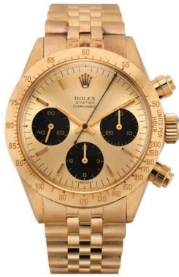
Rolex Reference 6265. An extremely rare and incredibly attractive yellow gold chronograph wristwatch with “3 Liner” dial, bracelet and original certificate, made circa 1969. Estimate: HKD1.17 – 2.34 million / USD150,000 – 300,000