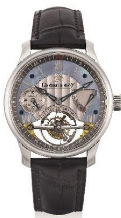
Greubel Forsey rare and exceptional platinum double tourbillon wristwatch with 72-hour power reserve and mother of pearl dial, with Greubel Forsey presentation box and certificate, made 2009. Estimate: HKD800,000 – 1.2 million / USD103,000 – 154,000