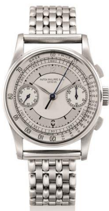
Patek Philippe Reference 130. An extremely rare and attractive stainless steel chronograph wristwatch with two tone silvered sector dial, bracelet and box, made 1939. Estimate: HKD2 - 4 million / USD256,000 - 513,000

Highly appealing and collectible vintage Patek Philippe wristwatches in excellent condition are selected for this season, the highlight of which is a Reference 3448 "Padellone" offered for the first time at auction. Boasting all the best qualities, the present example comes from the family of the original owner who acquired this stunning example in the 1970s in Zurich. Iconic and classic references such as 130, 1463, 1518 and 2497 together offer a comprehensive glimpse of the history of haute horlogerie and Patek Philippe's outstanding craftsmanship, enticing both scholars and collectors alike.