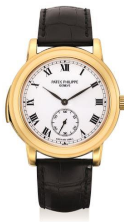
Patek Philippe Reference 5079J-001. An extremely fine, large, rare and elegant yellow gold "Cathedral" minute repeating wristwatch with enamel dial, box and certificate of origin, made 2004. Estimate: HKD2 - 4 million / USD256,000 - 513,000