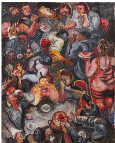
ZHANG ENLI b.1965 Eating #4, 2000 Estimate: HKD 6,000,000 - 8,000,000