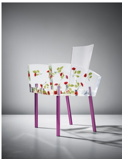
SHIRO KURAMATA 1934 - 1991 'Miss Blanche' chair , designed in 1988 Estimate: HKD 2,200,000 - 3,200,000

Among the highlights from design are museum quality pieces including a 'Miss Blanche' chair by Shiro Kuramata (estimate: HKD 2,200,000 - 3,200,000, illustrated left ). One of Japan's most revered 20th Century designers, Kuramata was an influential and creative tour de force . The chair is named after the central character Blanche DuBois in the famed play "A Streetcar Named Desire", written by American playwright Tennessee Williams. The chair resonates with her tragic beauty which is contained within an oneiric and diaphanous delusion. Highly desirable, an edition of 56 'Miss Blanche' chairs were produced and are part of institutional collections such as the Museum of Modern Art in New York, the Museum of Modern Art in San Francisco, the Dallas Museum of Art and M+ Museum in Hong Kong. Also featured in the sale is Ron Arad's Southern Hemisphere (estimate: HKD 1,800,000 - 2,400,000, illustrated below left ), which walks the line between design and sculpture. A figurative example of Arad's ability to transform hard materials into soft, malleable and even liquid forms, Southern Hemisphere is a representative display of beauty in organic form. Distancing himself from the rigidity of mass-production, Arad's designs are renowned as unique or limited edition objects, making him a landmark designer in Britain in the 1980s and 1990s.