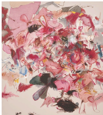
CHRISTINE AY TJOE b.1973 Small Flies and Other Wings, 2013 Estimate: HKD 900,000 - 1,200,000