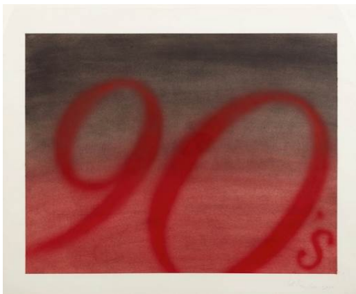
ED RUSCHA b. 1937 The 1990s , 2000 Estimate: HKD 1,500,000 - 2,500,000

Bird House hails from an extremely desirable period of Doig's works, during which time he produced his most sought-after snowscapes. In the present work, the titular bird house is engulfed by a spectacular web of gnarling branches, a testament to Doig's endless fascination with portraying scenes where civilisation and nature come head to head. The dreamlike Bird House's muted hues of pinks, blues, and yellow are also immediately reminiscent of Monet's snowscapes, an influence which the artist himself has noted as important.