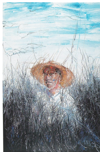
ZENG FANZHI b.1964 A Man with a Straw Hat, 2004 Estimate: HKD 5,000,000 - 7,000,000