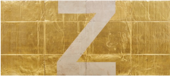
DANH VO b. 1975 Alphabet (Z) , 2011 Estimate HKD 1,500,000 - 2,500,000

Danh Vo's Alphabet (Z) illustrates the artist's principal ideas of coexistence or perhaps convergence - where discarded Vietnamese cardboard boxes are lined with opulent gold leaf, and ironically given the same treatment as sanctified objects in Southeast Asia. The letter Z dominating the foreground is extrapolated from the Bowditch alphabet as standardised in the maritime community in the early 19th century, furthering Vo's lexicon of a concomitance of realities/ idealities.