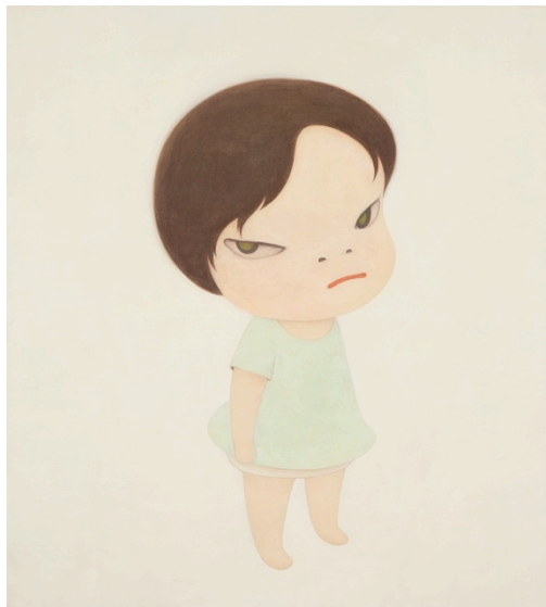
YOSHITOMO NARA b. 1959

Led by Yoshitomo Nara's Masterwork Last Warrior / The Unknown Soldier