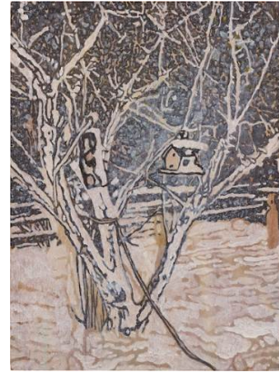
PETER DOIG b. 1959 Bird House , 1996 Estimate: HKD 2,000,000 - 3,000,000

Danh Vo's Alphabet (Z) illustrates the artist's principal ideas of coexistence or perhaps convergence - where discarded Vietnamese cardboard boxes are lined with opulent gold leaf, and ironically given the same treatment as sanctified objects in Southeast Asia. The letter Z dominating the foreground is extrapolated from the Bowditch alphabet as standardised in the maritime community in the early 19th century, furthering Vo's lexicon of a concomitance of realities/ idealities.