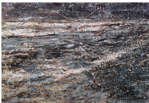
ANSELM KIEFER b. 1945 Voyage au Bout de la Nuit [Journey to the end of the night] , 2004 Estimate: HKD 5,500,000 - 7,500,000

A further highlight is a monumental canvas by Anselm Kiefer. From a distance, Voyage au Bout de la Nuit [Journey to the End of the Night] resembles a chart of constellations (estimate: HKD 5,500,000 - 7,500,000, illustrated left ). Upon closer inspection, the sheer wealth of texture and detail becomes apparent. The heavily worked and impastoed surface features scattered paint drops on a background that resembles an arid landscape, bringing the terrestrial and the celestial into alignment and the mingling currents of science, myth and belief apparent into the painting. Voyage au Bout de la Nuit recurs both as a title for some of the artist’s most celebrated works, but also as an acclaimed exhibition, embodying a deep fascination with the grand morass of history and humanity.