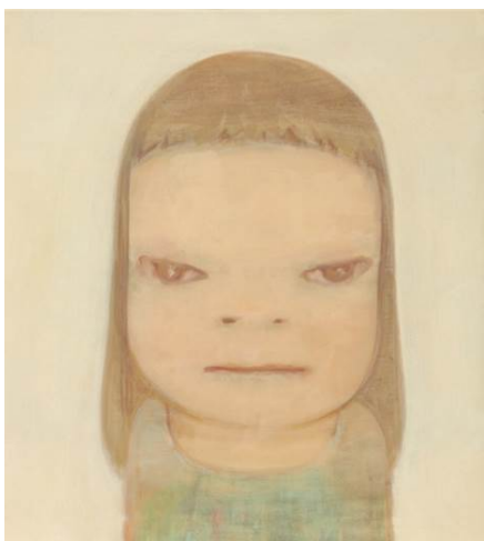
YOSHITOMO NARA b.1959 Study for Miss Spring, 2012 Estimate: HKD 2,500,000 - 3,500,000

Contemporary art from South East Asia is also represented in the sale, including a poignant work by prominent Indonesian female artist Christine Ay Tjoe. Recognised for her energetic canvases filled with primal ruby and vermilion tones, her intensely personal works explore the strains of contemporary living on the psyche. Small Flies and Other Wings is composed of the wings of various insects in recognition of the ephemeral and fleeting beauty of the creatures (estimate: HKD 900,000 - 1,200,000, illustrated below bottom right ). Ruminating on the transitory nature of living, Christine Ay Tjoe provides a commentary on frenetic urban societies where one's mark is often untraceable.