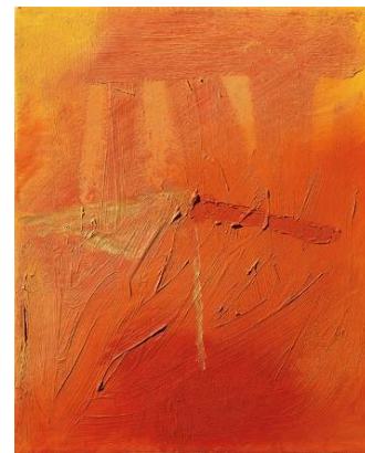
GERHARD RICHTER b. 1932 Abstraktes Bild (454-4) , 1980 Estimate: HKD 2,400,000 - 3,500,000

Ed Ruscha's text-based paintings have revolutionised the relationship between the visual and the semiotic. Ruscha fully embraced the visual culture of Los Angeles, making him a leading figure in the early emergence of the West Coast scene. Ruscha has pursued a lifelong artistic exploration into the formal elements of printed text and its fluid relationship with visual images. By culling words, images and phrases that have been imprinted in his memory and that are found across mass media, from print culture to advertising billboards, Ruscha's work often serves as a visual encyclopedia of American culture.