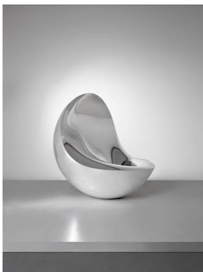
RON ARAD b.1951 Southern Hemisphere , 2007 Estimate: HKD 1,800,000 - 2,400,000

Included in the auction is a superlative set of eight 'Egyptian' dining chairs and a large extendable dining table designed by the famous Danish architect Finn Juhl in 1949 (estimate: HKD 570,000 - 700,000 and HKD 230,000 - 330,000, illustrated below right ). Handcrafted by Niels Vodder, these rare examples were executed in exquisite Brazilian Rosewood, which was selected and skilfully produced by the master cabinetmaker to create both the dining chairs and table. In 1960, the fine 'Egyptian' dining chair was selected and included in the dining room of the Danish Embassy, Washington DC.