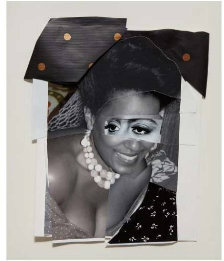
Mickalene Thomas Clarivel #1 , 2014 Estimate $6,000 - 8,000