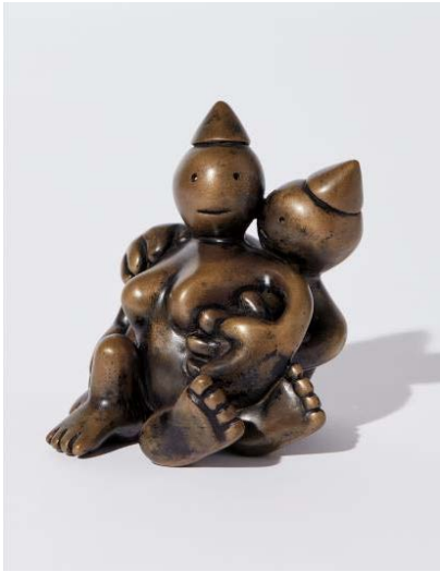
Tom Otterness Lovers , 1992 Estimate $6,000 - 8,000