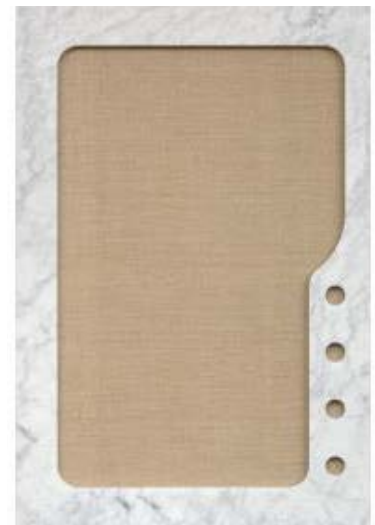
Analia Saban Kohler 5931 Kitchen Sink #3, 2013 Estimate: $12,000-18,000