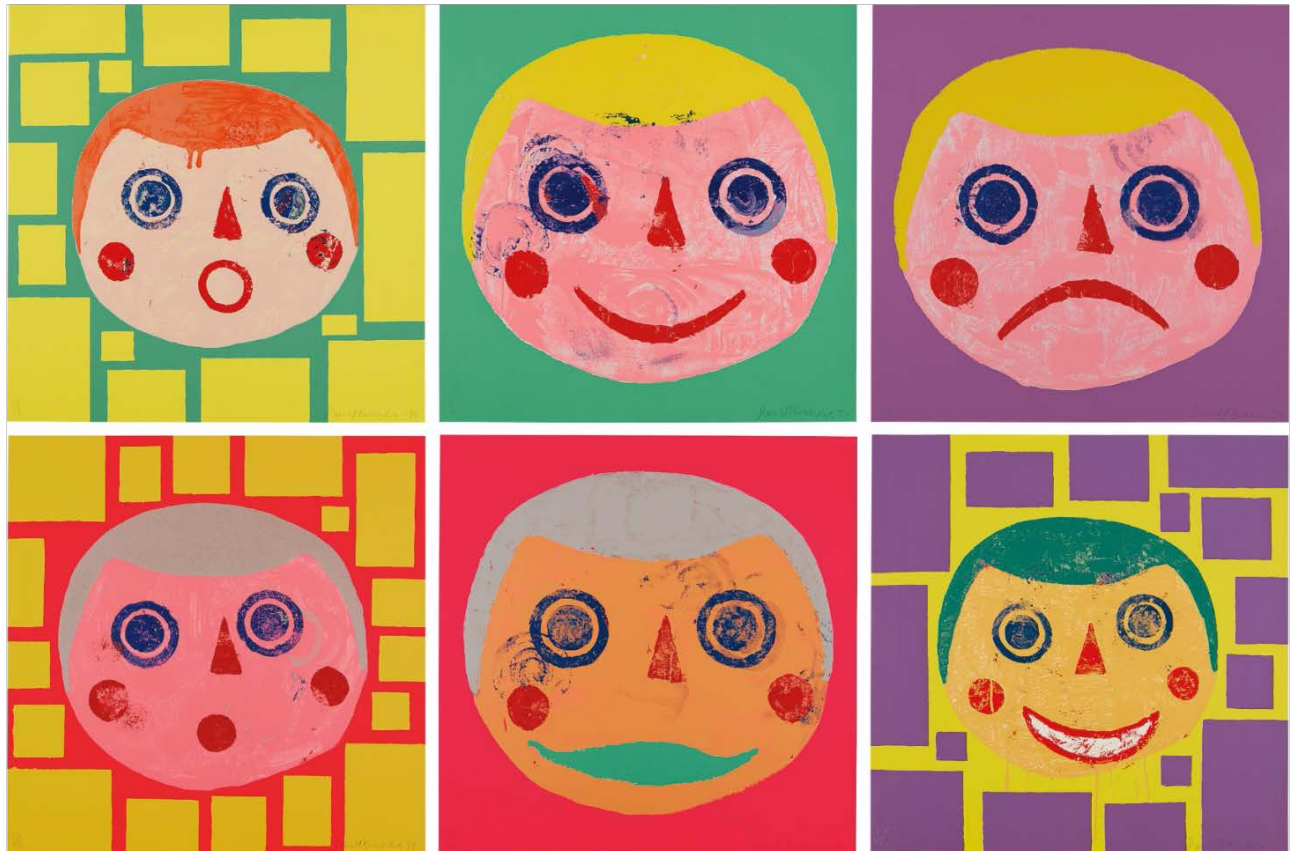
Donald Baechler Coney Island , 1994 Estimate: $4,000-6,000

Works will be On View at Phillips from 19 – 25 July