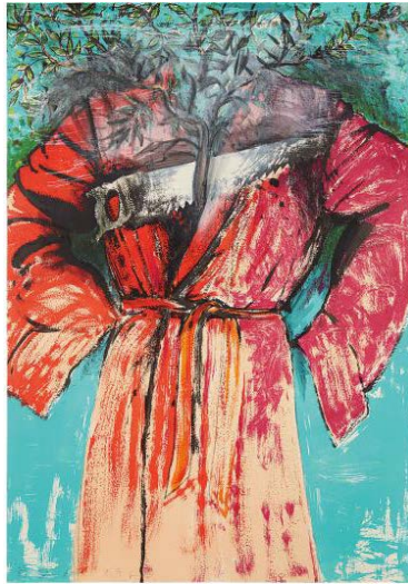
Jim Dine Atheism , 1986 Estimate $4,000 - 6,000