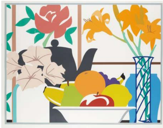
Tom Wesselmann Still Life with Petunias, Lilies, and Fruit, 1988 Estimate: $10,000-15,000