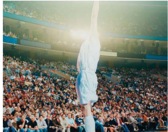
Paul Pfeiffer Four Horseman of the Apocalypse (11), 2004 Estimate: $8,000 - 12,000