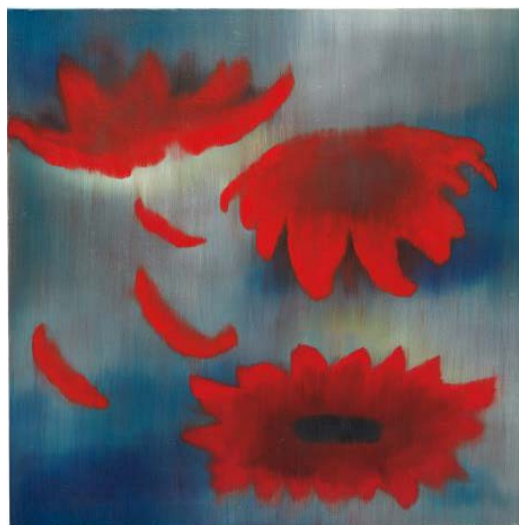
Ross Bleckner Sky Flowers, 2014 Estimate: $12,000-18,000