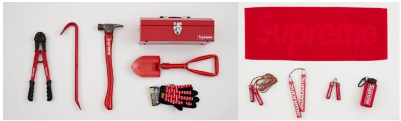
Left: Supreme Tool Set; Estimate: HKD 20,000-30,000| Right: Supreme Gym Set; Estimate HKD 15,000-20,000