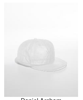
Daniel Arsham Crystal Relic 001 Estimate: HKD 12,000-16,000