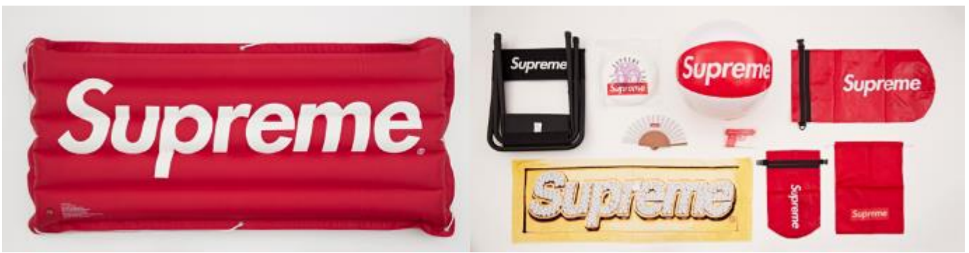
Supreme Beach Set + Inflatable Raft; Estimate: HKD 40,000-60,000