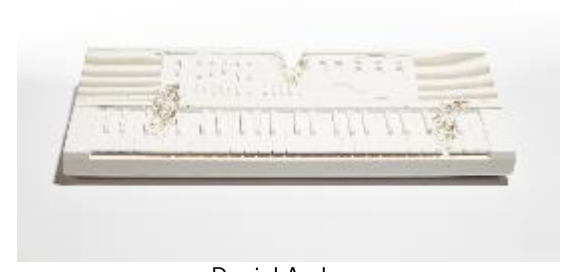
Daniel Arsham Future Relic 09 (Keyboard) Estimate: HKD 10,000-20,000