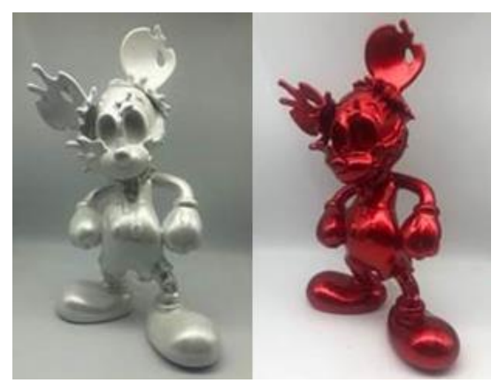
Matt Gondek Left: Deconstructed Mickey (White) Estimate: HKD 30,000-40,000

Right: Deconstructed Mickey (Red) Estimate: HKD 30,000-40,000