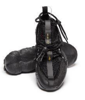
Kerby Jean-Raymond for Pyer Moss x Reebok DMX Fusion 1 Experiment, 2018