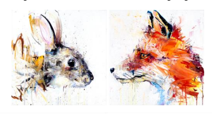
Tongue + Chic Sneaker Exhibition Highlights