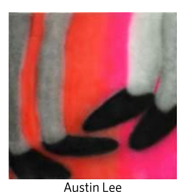
Meeting Estimates: HKD 80,000-100,000