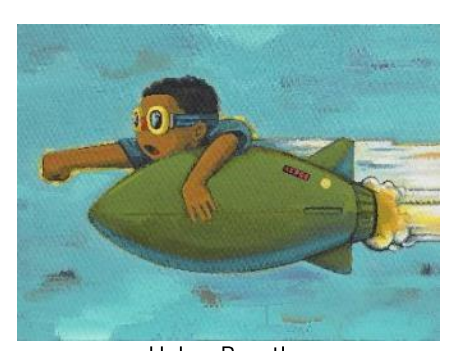
Hebru Brantley Untitled Estimate: HKD 70,000 - 90,000