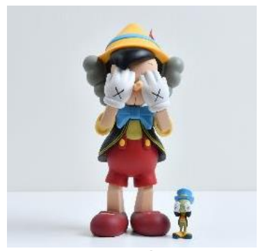
KAWS PINOCCHIO & JIMINY CRICKET Estimate: HKD 30,000-40,000

Right: Dior x KAWS, BFF (Pink) Estimate: HKD 80,000-120,000