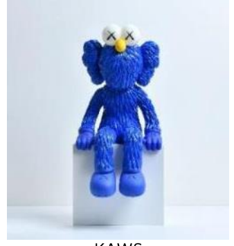
KAWS SEEING (LED Light) Estimate: HKD 100,000-200,000