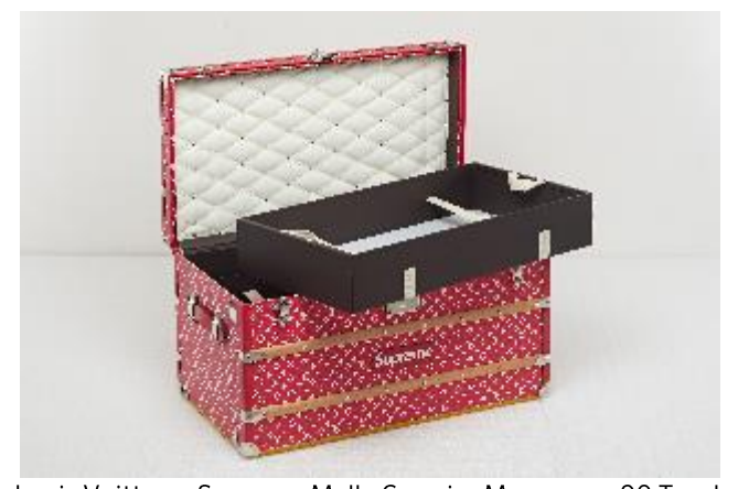
Louis Vuitton x Supreme Malle Courrier Monogram 90 Trunk (Red); Estimate: HKD 600,000 – 800,000