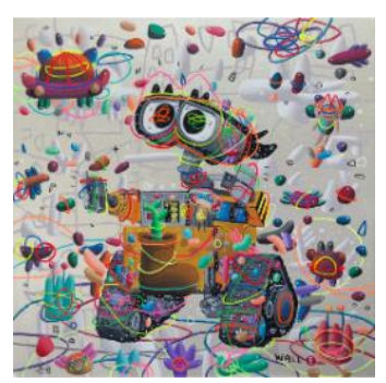
Ronald Apriyan Green Seed for the World Estimate: HKD 8,000-12,000