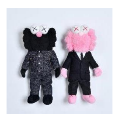
Left: Dior x KAWS, BFF (Black) Estimate: HKD 80,000-120,000

Right: Dior x KAWS, BFF (Pink) Estimate: HKD 80,000-120,000