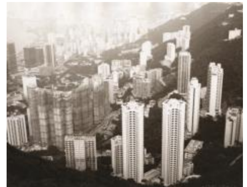
Andy Warhol, The Great Wall of China, 1982 - 1987, Andy Warhol and Bellboy, 1982 and Hong Kong, 1982