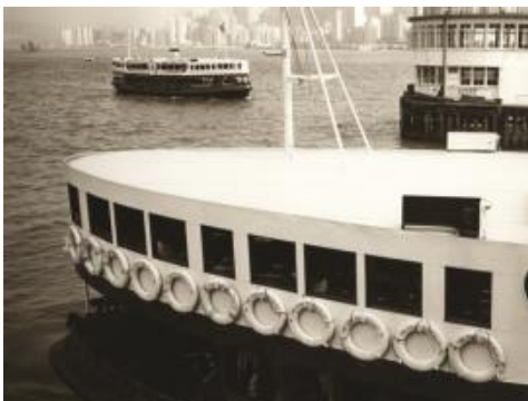
Andy Warhol, Hong Kong Harbour (Boats), 1982

When considered against Warhol's philosophy of reproduction and repetition, these photographs of modern China take on another meaning, evoking the country's economic development thanks to its mass manufacture. Moreover, Mao's immense influence on the country, his philosophies on the masses, and the country's veneration for him, can all be counted within the very lexicon of Warhol's artistic language of duplication and mass-distribution. After his trip, Mao's image became a symbol of Warhol's oeuvre, and remains amongst the artist's most important depictions, alongside Marilyn Monroe, Elvis Presley, and Jackie Kennedy.