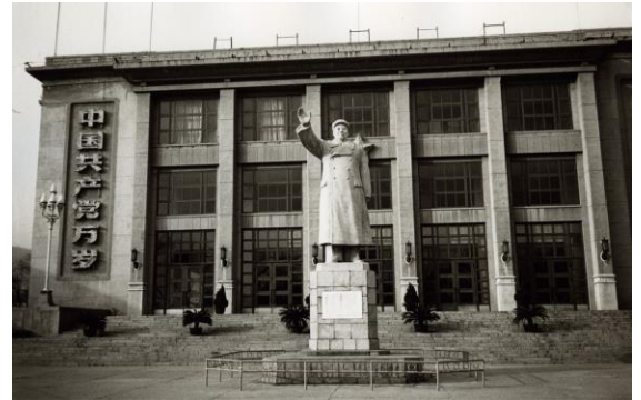
Andy Warhol, Statue of Mao and Building, 1982

Warhol began creating paintings of Chairman Mao in 1972, and his fixation with him materialised in a chance excursion to China between 27 October and 6 November, 1982, where he would come vis-à-vis with the subject of his countless works. This trip came exactly 10 years after President Nixon travelled to Beijing in 1972, as well as 15 years before Hong Kong's Handover. At the time of Warhol's visit, Deng Xiaoping had only recently begun opening China to the global economy and the West and it was still very much closed to the outside world. Hong Kong was also on the cusp of change, soon to part with British colonial rule.