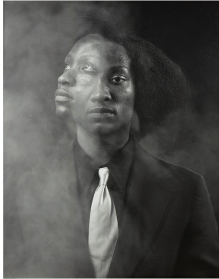
Rashid Johnson The New Negro Escapist Social and Athletic Club Twoness , 2009 Estimate: $10,000-15,000