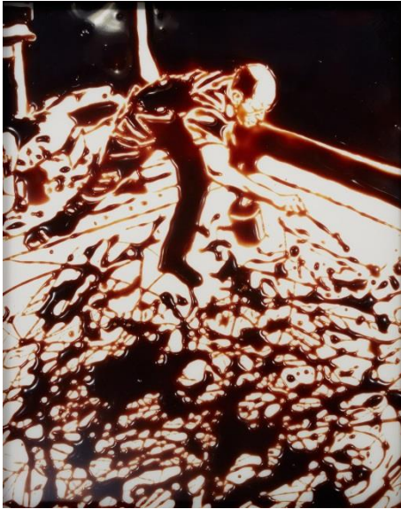
Vik Muniz Action Photo, after Hans Namuth (from Pictures of Chocolate ), 1997 Estimate: $70,000-100,000