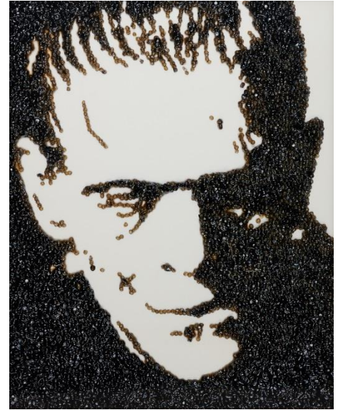
Vik Muniz Frankenstein (from Caviar Monsters ), 2009 Estimate: $20,000-30,000

Auction: Sunday, 8 May 2016, 6pm | Tuesday, 10 May 2016, 11am Auction viewing: 30 April-8 May | Monday to Saturday 10am-6pm, Sunday 12pm-6pm Location: 450 Park Avenue, New York