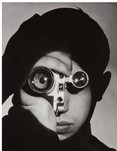
Andreas Feininger The Photojournalist (Dennis Stock), 1955 Estimate: $12,000-18,000