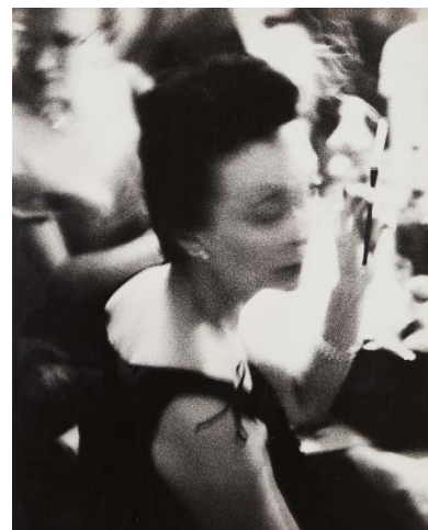
William Klein Woman + Cigarette Holder, Ball, Waldorf, New York, 1955 Estimate: $30,000-50,000