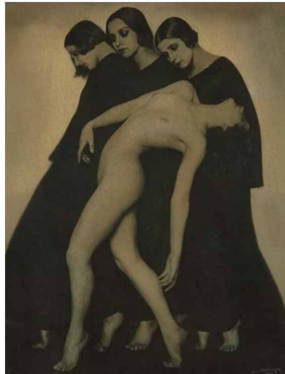
Rudolf Koppitz Bewegungsstudie (Movement Study) , 1924 Estimate: $200,000-300,000

Rudolf Koppitz's masterpiece, Bewegungsstudie (Movement Study) , will also be offered from Dr. Unter's collection (illustrated right). This print is remarkable for its large size, masterful print quality, extensive exhibition history, and direct provenance. More than other prints of this image, the example offered here delivers a remarkable range of detail and tonal subtlety. The faces of the dancers are rendered with great clarity, as are their delicately arched feet, which are frequently obscured in other prints. The dancers' black robes, which at first seem absolutely black, show detail in their folds upon prolonged examination, giving them a sense of three-dimensionality and movement. As evidenced by the array of printed labels affixed to the reverse of the print, it has been featured in nine exhibitions in Europe and America between 1928 and 1932, a testament to Koppitz's ambition in widely publicizing his work. Koppitz later gave this print to his assistant Alfred Ernst, an accomplished photographer in his own right. Stylized, graceful, and mysterious, Bewegungsstudie has remained Koppitz's best known work. This masterful, large-format multiple-gum print represents the ideal presentation of this timeless image and it is clear that Koppitz regarded this print highly and that it met his own exacting standards.