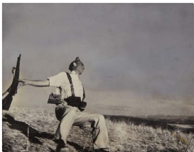
Robert Capa Death of a Loyalist Soldier , 1936 Estimate: $80,000-120,000