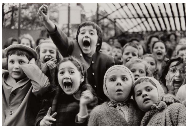
Alfred Eisenstaedt Children at a Puppet Theatre, Paris, 1963 Estimate: $15,000-25,000

Auction: Monday, 9 April 2018 | 10am & 2pm EDT