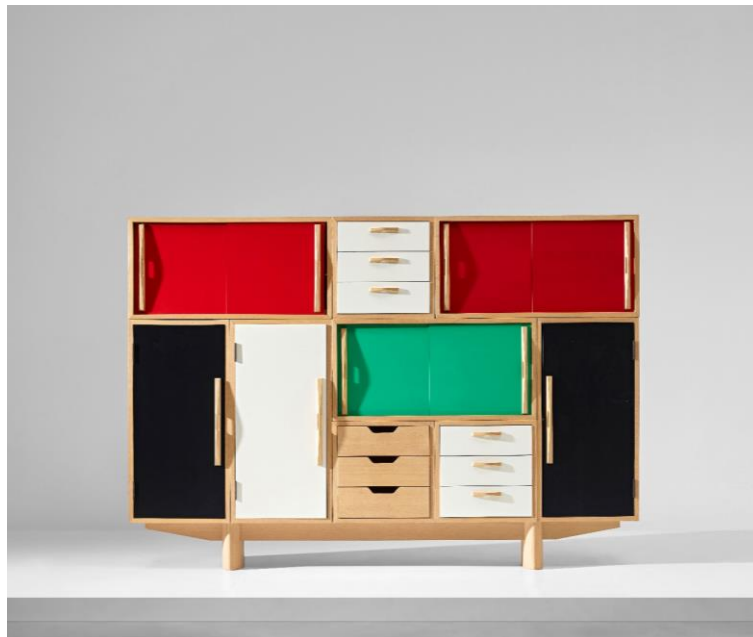
Prototype cabinet, produced for the Saison exhibition, designed 1960s, executed 1998 £5,000-7,000

HEATWAVE crosses multiple genres and medias, including works of design from the collection of Terry Ellis and Keiko Kitamura. Buyers for Tokyo-based label BEAMS fennica, Ellis and Kitamura have established a curated collection fusing mid-century modernism and classic Scandinavian design with traditional Japanese folk craft. A leading example is a Prototype cabinet by Yanagi, produced for the Saison exhibition.