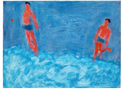
Katherine Bradford Wader Boys , 2016 Estimate: £3,000 - 5,000

HEATWAVE crosses multiple genres and medias, including works of design from the collection of Terry Ellis and Keiko Kitamura. Buyers for Tokyo-based label BEAMS fennica, Ellis and Kitamura have established a curated collection fusing mid-century modernism and classic Scandinavian design with traditional Japanese folk craft. A leading example is a Prototype cabinet by Yanagi, produced for the Saison exhibition.