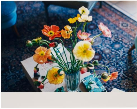
Wolfgang Tillmans Mohn , 1988 Estimate: £5,000 - 7,000