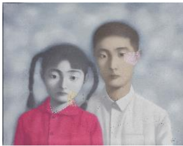
Zhang Xiaogang b. 1958

In 1999 the prolific Japanese artist Yoshitomo Nara created one of his most iconic figures and inaugurated his definitive sculptural series: The Little Pilgrims (Night Walking) . As a comprehensive example of this seminal moment, the Complete Set of The Little Pilgrims (Night Walking) marks a crucial turning point in the artist's prodigious career, signifying the diversification of his practice beyond its roots in the art of drawing, and thus solidifying the importance of sculpture and installation as a means of realising his idiosyncratic visions.