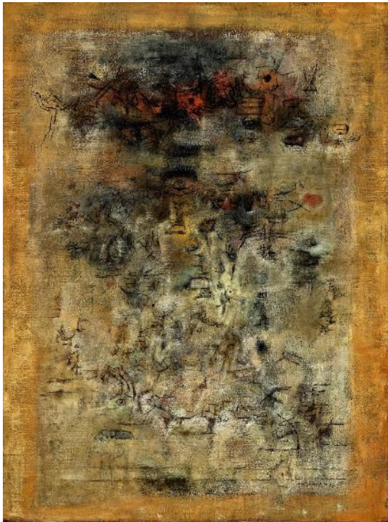
Zao Wou-Ki 1920-2013 Ailleurs , 1955 oil on canvas Estimate: HKD 40,000,000 - 60,000,000