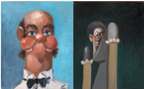
George Condo b.1957

Among the leading lots in the 20th Century & Contemporary Art & Design Day Sale is George Condo's Jean Louis with one Ear & Jean Louis' Wife's Sister (illustrated below, left). The present lots hail from George Condo's seminal early portraiture series, Existential Portraits , a small handful of works that the artist created which investigated the human psyche. Having hosted two very successful Banksy exhibitions in Hong Kong and Taipei recently, the Hong Kong Day Sale will also see Banksy feature again with Ballerina CP/03 (illustrated below, right). As part of the artist's Better Out Than In residency in 2013, a month-long show that took place in New York's Central Park where Banksy unveiled at least one work of art daily, this work was one of the authentic signed canvases sold at the stall.