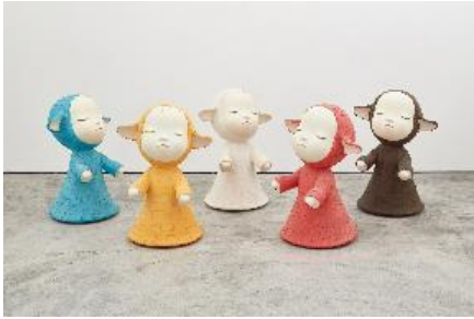
Yoshitomo Nara 1959

The Little Pilgrims (Night Walking) , 1999