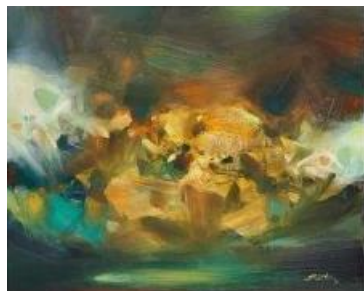
Chu Teh-Chun, 1920-2014 Éclat passager , 2007 oil on canvas Estimate: HKD 1,600,000 – 2,000,000

Phillips will present 6 works from an Important Hong Kong Collection across the Evening and Day Sales. The works hail from a collection spanning nearly four decades, one which features a singular preoccupation on fine art created by the world's most renowned Asian artists that resided and worked in postwar Europe. These pioneering artists, including Zao Wou-Ki, Chu Teh-Chun and T'ang Haywen, brought with them to Europe a multitude of Eastern traditions that were central to their thinking. The present work, Chu Teh-Chun's Éclat passager , displays the artist's meticulous artistry with its elaborate details filling the composition mapped across the entire canvas. With the artist's dexterous mastery of the contrasts between light and dark, the work fully conveys the poetic essence of traditional Chinese ink painting. The unbridled, broad brushstrokes roam in the background, while the foreground is enriched with colours, embodying the height of pastoral beauty.