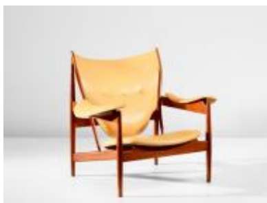
Finn Juhl 1912-1989 Important and early 'Chieftain' armchair, FJ 49 A Bangkok teak, leather Designed 1949, produced circa 1955 Estimate: HKD 500,000 – 800,000

In 1949 Finn Juhl designed the model 'FJ 49 A' armchair, which became primarily known as the 'Chieftain,' a title rarely used by the architect as he referred to it as the 'Big Chair'. When first exhibited at the Cabinetmakers' Guild, the 'Chieftain' was well received. Finn Juhl designed some of his finest cabinet-made furniture for the Cabinetmakers' Guild and the 'Chieftain' must be considered one of his most accomplished designs.