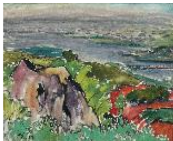
Liu Kang 1911-2004 West Lake , 1933 oil on canvas Estimate: HKD 250,000- 350,000

Phillips will present 6 works from an Important Hong Kong Collection across the Evening and Day Sales. The works hail from a collection spanning nearly four decades, one which features a singular preoccupation on fine art created by the world's most renowned Asian artists that resided and worked in postwar Europe. These pioneering artists, including Zao Wou-Ki, Chu Teh-Chun and T'ang Haywen, brought with them to Europe a multitude of Eastern traditions that were central to their thinking. The present work, Chu Teh-Chun's Éclat passager , displays the artist's meticulous artistry with its elaborate details filling the composition mapped across the entire canvas. With the artist's dexterous mastery of the contrasts between light and dark, the work fully conveys the poetic essence of traditional Chinese ink painting. The unbridled, broad brushstrokes roam in the background, while the foreground is enriched with colours, embodying the height of pastoral beauty.