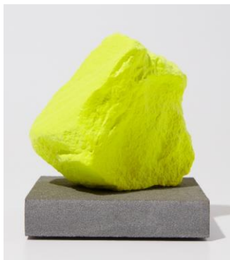
Ugo Rondinone Small Yellow Mountain , 2016 Estimate: $3,000-4,000