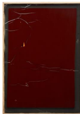
Graham Collins Shade Tree VI , 2013 Estimate: $2,000-3,000