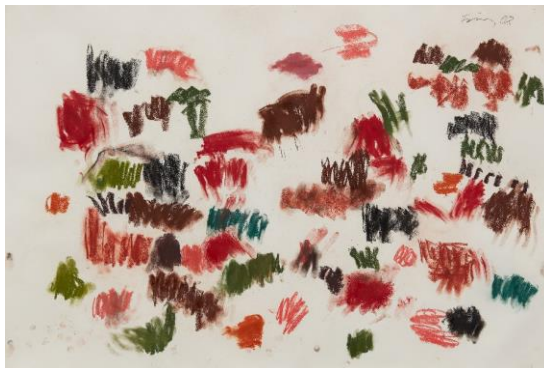
Gunther Forg Aller Retour , 2008 Estimate: $10,000-15,000