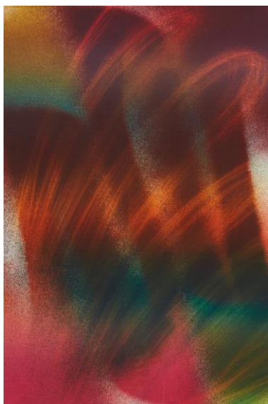
Katharina Grosse Untitled , 2007 Estimate: $8,000-12,000

Also among the sale highlights is Ron Gorchov’s Music from 1976 (illustrated right), which hails from the series of unique, saddle-shaped paintings that the artist has been creating for nearly forty years. Projecting from the wall the construction painted in a deep, stunning teal color with two of Gorchov’s comma like shapes rendered in stark black which seem to float within the center of the composition. The present work has been in the same private collection for the past four decades and is a prime example of Gorchov’s structural brilliance and carefully selected minimalist palette.