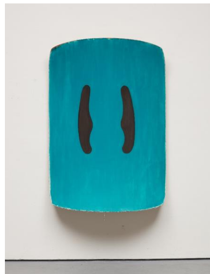
Ron Gorchov Music , 1976 Estimate: $40,000-60,000

Mark Flood’s Tundra Hoof Print (illustrated right) will also be offered in the auction. This is a beautiful, early example of Mark Flood’s iconic lace paintings. Tundra Hoof Print , from 2005 combines layers of delicate rainbow coloration with a small central window. The light peach opening seems to float on a different plane, projecting lightness from within the shrouded lace composition.