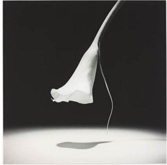
Robert Mapplethorpe Calla Lily , 1986 Estimate £50,000 -70,000

Further adding to the ULTIMATE highlights are two rare masterpieces by Robert Mapplethorpe: Self Portrait , 1988 and Calla Lily , 1986. Self Portrait , realised only as a gelatin silver print in an edition of 10 + 2 AP, was acquired by the present owner in 1996 at auction – the only time this image has appeared at auction – and has been in the same private collection for 20 years. Calla Lily , realised as a gelatin silver print edition of 10 + 2 AP, a platinum print with black borders in an edition of 2 and as two unique works, was acquired by the present owner in the 1980s from the Robert Miller Gallery and is appearing at auction also for the first time.