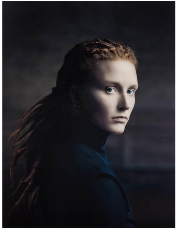
Desiree Dolron Xteriors IV , 2001 Estimate £30,000 - 50,000