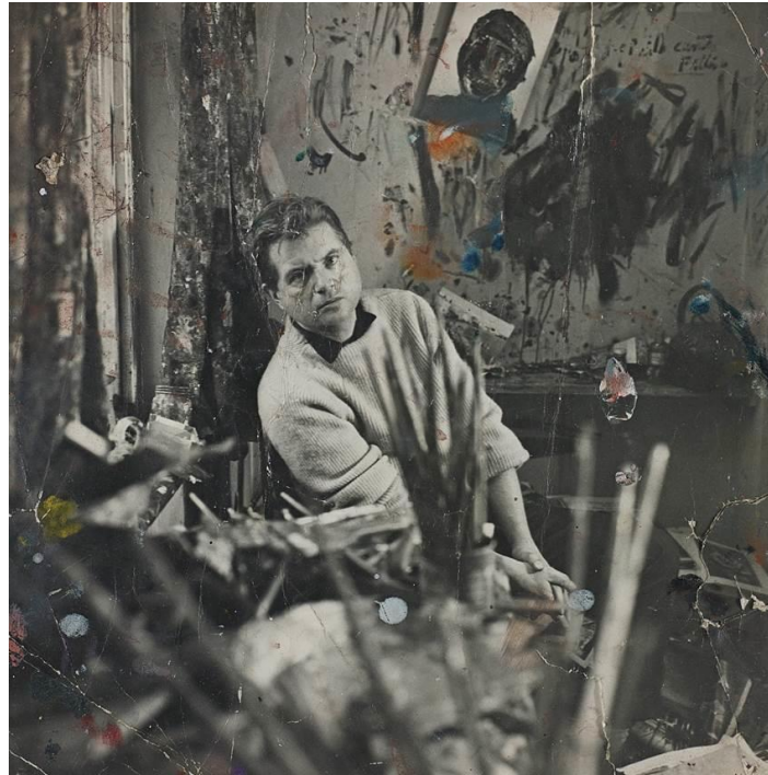
Cecil Beaton Francis Bacon in his studio , 1960 Estimate £25,000 - 35,000

PROPERTY FROM A PRIVATE COLLECTION, EUROPE