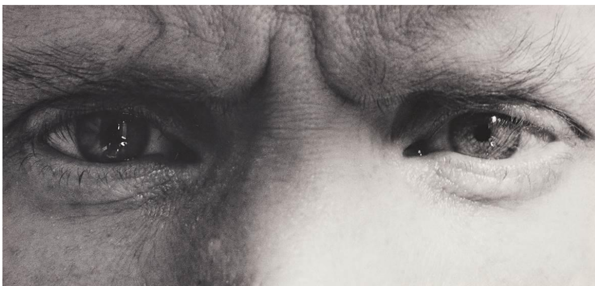
Robert Mapplethorpe Self Portrait , 1988 Estimate £60,000 - 80,000 To be offered in ULTIMATE

Auction to Offer Prominent Private Collections Including Property from the Collection of Paul and Toni Arden