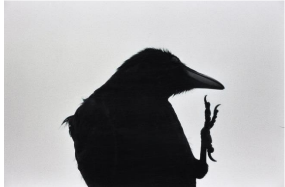
Masahisa Fukase 襟裳岬 [Erimo Misaki] Cape Erimo from 鴉 [Karasu] Ravens , 1976 Estimate £15,000 - 25,000

The cover lot of the sale is Masahisa Fukase's iconic image of a lone raven in profile from his seminal series Ravens . This powerfully evocative image, which can be read as a self-portrait, is blind-stamped on the cover of his 1986 photobook Ravens and is the first image reproduced. The British Journal of Photography selected Fukase's Ravens as the best photobook published between 1986 and 2009. This work is one of only two known extant large-format exhibition prints made by Fukase of this image; the other print, held at the Philadelphia Museum of Art, is signed in pencil on the verso and similar in print date and size.