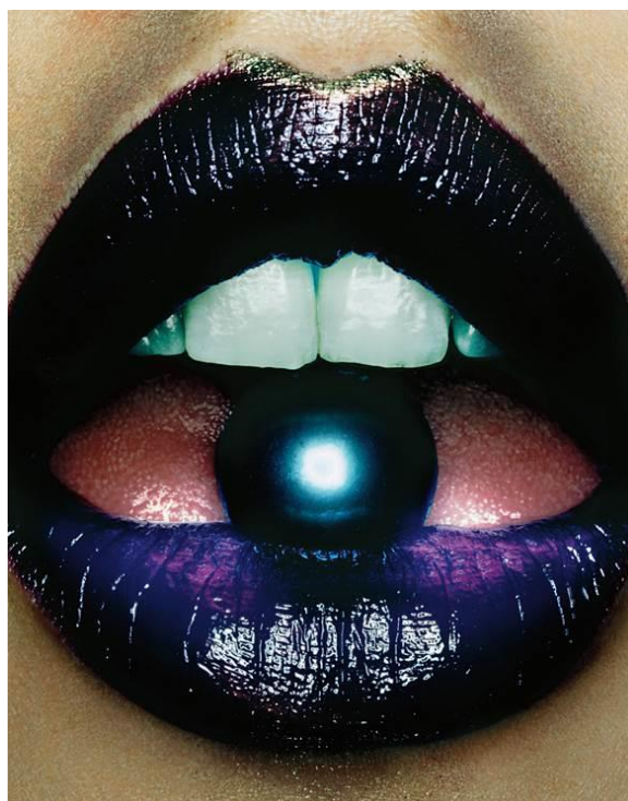
Nick Knight Black Pearl, 1996 Estimate £40,000 - 60,000