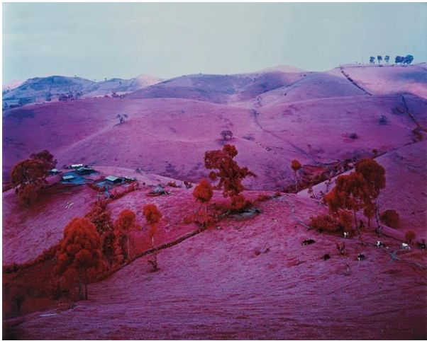
Richard Mosse Endless Plain of Fortune , 2011 Estimate £8,000 - 12,000