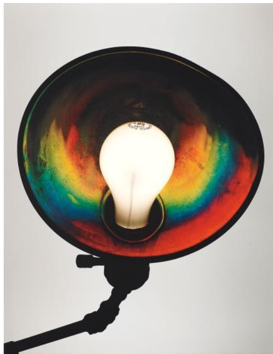
Irving Penn Bedside Lamp, New York , 2006 Estimate: £40,000-60,000