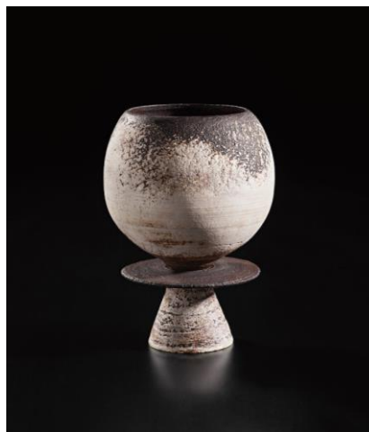
Hans Coper 1920-1981 Composite pot on foot with central disc , circa 1974 Estimate: £20,000-30,000