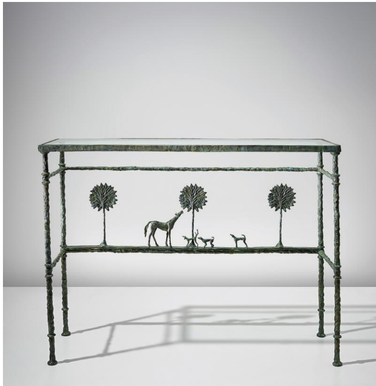
Diego Giacometti 1902-1985

Lucie Rie and Hans Coper – Potter and Artist