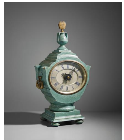
Sir Edwin Lutyens 1869-1944 Important and rare Mantel clock, designed for Lady Willingdon, the Viceroy's House, New Delhi, circa 1930 Estimate: £80,000-120,000

An Important and rare Mantel clock by Sir Edwin Lutyens, designed for Lady Willingdon, the Viceroy's House, New Delhi, circa 1930, is a perfect testimony to the great British architect's unique style, which was often suffused with wit (illustrated right). The clock takes the form of an urn surmounted by a vase finial supporting a flower. This is actually a brass key cast as a pansy, by family tradition a pun on the French word penser , a reminder to wind it up. Lutyens was famous for his bad puns. The oval clock face requires hands that expand and contract like tongs to ensure that the time can be read accurately. As was his wont when he was particularly pleased with a design, Lutyens commissioned one or two copies for himself and his family (a second clock remains with another descendant). The present lot can be seen sitting at Lutyens's desk in a photograph of the late 1930s. Also coming from the Lutyens Family Estate is an Important and rare 'Mercury Ball' chandelier, designed for the Viceroy's House, New Delhi, circa 1930 (estimate: £20,000-30,000).