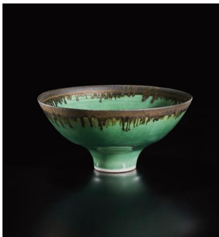
Lucie Rie 1902-1995 Footed bowl , circa 1980 Estimate: £40,000-60,000