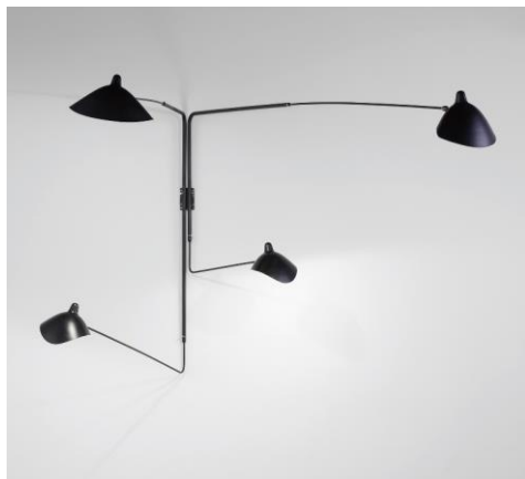
Serge Mouille 1922-1988 Pivoting four-armed wall light with 'Lampadaire' and 'Casquette' shades, designed 1954, executed circa 1970 Estimate: £50,000-70,000