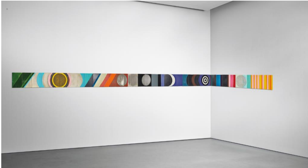
Ettore Sottsass, Jr. 1917-2007 Important frieze , circa 1965 Estimate: £130,000-180,000

Also included is an Important frieze , circa 1965, a ceramic painting-structure (illustrated below left). Sottsass' experimental studies of structure and colour found solutions to the recurring issue of decoration: colour, light and symbols are not decorative elements, but also act as structure. The Frieze , comprised of 35 tiles, is presumably from Sottsass' 'Camera da letto' (Bedroom), designed for 'La casa abitata', an exhibition held in Palazzo Strozzi, Florence in the spring of 1965. The present lot appears to be a portion of the Frieze , installed around the room. Further highlights include a Unique 'Urano' ceiling light , circa 1957, from a Private Italian Collection (illustrated below right).