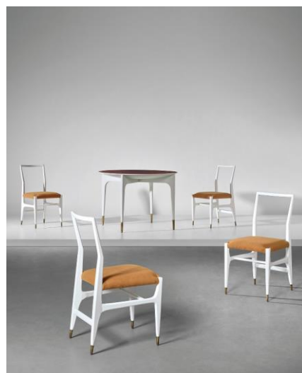
Gio Ponti 1891-1979 Rare dinette table and set of four side chairs, circa 1950 Estimate: £35,000-55,000