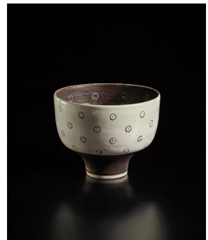
Lucie Rie 1902-1995 Footed bowl , late 1970s Estimate: £30,000-40,000