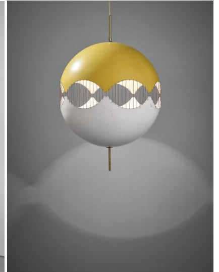
Ettore Sottsass, Jr. 1917-2007 Unique 'Urano' ceiling light , circa 1957 Estimate: £50,000-70,000