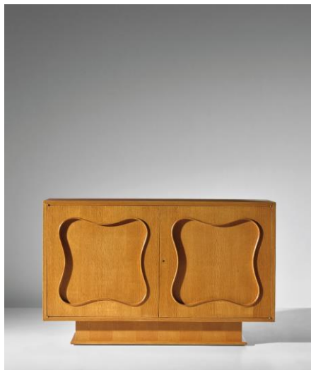
Jean Royère 1902-1981 'Trèfle' sideboard, circa 1960 Estimate: £80,000-120,000