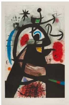
Joan Miró Le Permissionnaire (Soldier on Leave) , 1974 Estimate: $30,000-50,000