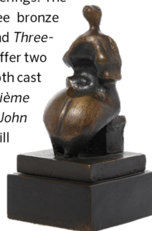
Henry Moore Maquette for Seated Woman , 1957/1978 Estimate: $20,000-30,000