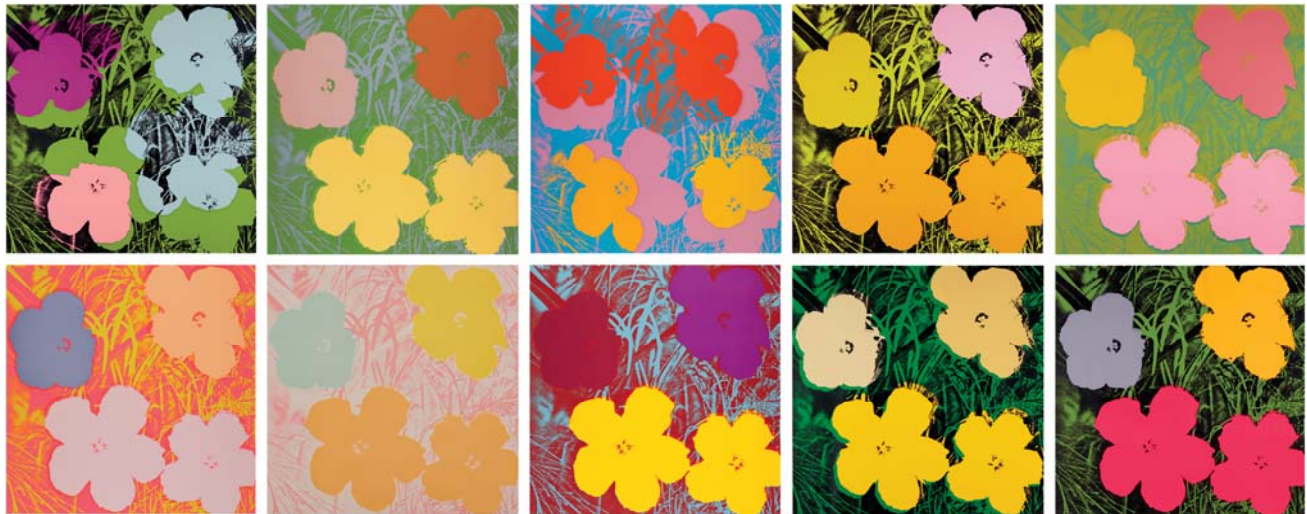
Andy Warhol Flowers , 1970

Evening and Day Sessions to Feature Over 400 Works by Picasso, Moore, Bacon, Twombly, Bourgeois, Motherwell, and Warhol