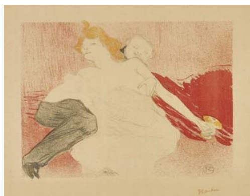
Henri de Toulouse-Lautrec Débauche (deuxième planche) , 1896 Estimate: $25,000-35,000