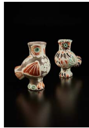
Pablo Picasso Wood-owl (Chouette) , 1959 & 1969 Estimate (each): $10,000-15,000