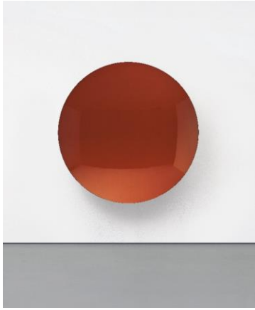
Anish Kapoor Momo , 2006 Estimate: £250,000-350,000