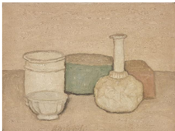
Giorgio Morandi Natura morta , circa 1952 Estimate: £600,000-800,000

exhibition history in the most prominent institutions worldwide, Girl in Mirror is a crucially significant work that captures the crux of Lichtenstein's painterly oeuvre, idiosyncratically composed of Ben-Day dots debating the relationship between high art and mass culture.