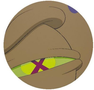
KAWS Untitled , 2012 Estimate: £300,000-500,000