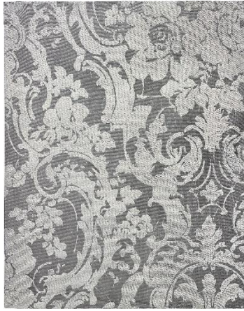
Rudolf Stingel Untitled , 2009 Estimate: £250,000-350,000