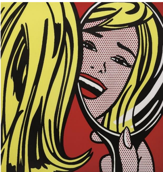
Roy Lichtenstein Girl in Mirror , 1964 Estimate: £4,500,000 - 6,500,000

Martin Kippenberger's self-portrait Ohne Titel (Meine Lügen sind ehrliche) (illustrated page one) is also among the selection of German masterworks in the Evening Sale. Executed in 1992, this work was painted alongside Kippenberger's