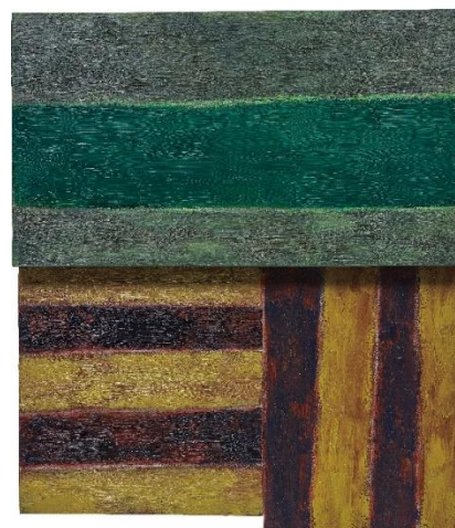
Sean Scully Dust , 1984 Estimate: £400,000-600,000

Among the leading lots in the 20th Century & Contemporary Art Day Sale is Sean Scully's Dust (estimate: £400,000-600,000). In this work, stripes of rich shades capture Scully's characteristic architectural composition. Having achieved a world auction record for KAWS in the New York Evening Sale in November 2018, the London Day Sale will see KAWS feature again with Untitled (estimate: £300,000-500,000). Painted in 2012, this work is representative of KAWS' exploration in recent years of fragmented cartoon imagery. Additional highlights in the Day Sale include Rudolf Stingel's Untitled (estimate: £250,000-350,000) and Anish Kapoor's Momo (estimate: £250,000-350,000).