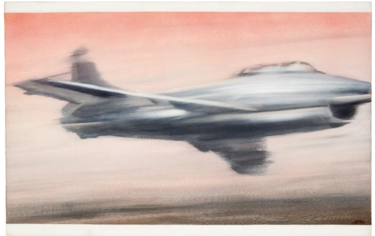
Gerhard Richter Düsenjäger , 1963 Estimate: £10,000,000-15,000,000

The Evening Sale is led by Düsenjäger (Jet Fighter) , one of Gerhard Richter's historically iconic early works, serving as the top lot. Stretching two metres in width, the work is one of the artist's first Photo Paintings and dates from the dawn of German Pop art. The work is the second of a group of eight celebrated paintings that Richter made of warplanes between 1963 and 1964; with its rare use of colour, it is an exceptional example that expands on the artist's well-known grisaille palette. Of the eight paintings from the series, four are in important German museums, namely the Museum Frieder Burda, Baden-Baden, the Hessisches Landesmuseum, Darmstadt, Städtische Galerie Wolfsburg, and the Pinakothek der Moderne, Munich. Echoing concurrent artistic movements in the United States, Düsenjäger recalls Roy Lichtenstein's Blam from 1962. By 1963, when Düsenjäger was painted, Richter had honed a new and persuasive visual language which would become the cornerstone for his artistic development. During the course of 1963, the success of Richter's photorealistic works would see his works celebrated at his first major exhibition in Düsseldorf, as well as the establishment of his first contract with an art dealer. It is a further tribute to the importance of Düsenjäger that it was formerly owned by the eminent artist Günther Uecker.