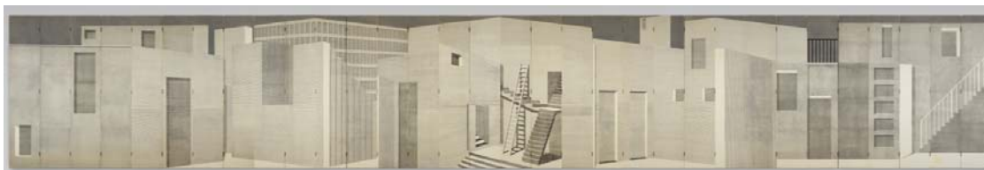
Piero Fornasetti La Stanza Metafisica (Metaphysical Room), 1958 Estimate: $200,000-300,000

Also among the sale's highlights is Piero Fornasetti's "Stanza Metafisica" (Metaphysical Room). Piero Fornasetti was a phenomenally talented and prolific painter and illustrator, but his talents soared far beyond two-dimensional artwork. He was fascinated by the organization of interior spaces and the screen, at once a blank canvas, a theatrical curtain, and a permutable and modular piece of furniture, was the perfect springboard for Fornasetti's ideas. Fornasetti was particularly interested in Japanese screens and was a connoisseur of the various forms, styles, and techniques. Fornasetti synthesized all of these ideas in his famous "Stanza Metafisica" (Metaphysical Room). Composed of thirty-two panels decorated with a surreal design of stairways, passageways, and ladders, it was designed as a space for meditation that could be set up in various ways according to the needs of the user.