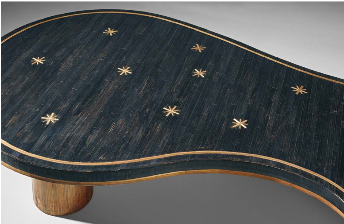
Jean Royère "Flaque" low table, circa 1955 Estimate: $180,000-250,000