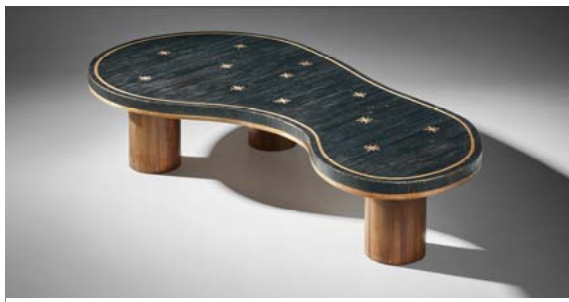
Jean Royère "Flaque" low table, circa 1955 Estimate: $180,000-250,000

Jean Royère's "Flaque" low table, circa 1955, will be offered among the sale's highlights on 6 June. With "flaque" meaning "puddle" in French, this table illustrates the influence of biomorphism introduced by artists such as Hans Arp and Alexander Calder and situates Royère's design within a larger international discourse. From the 1930s, designers including Frederick Kiesler, Eileen Gray, Charlotte Perriand, and Isamu Noguchi began exploring biomorphism in their work, departing from more traditional furniture forms. Royère employed straw marquetry for his "Flaque" table, a traditional technique meant to imitate wood veneer which had been in use in Europe since the seventeenth century. Revitalized by other designers in the 1930s, the technique of straw