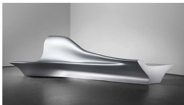
Zaha Hadid Bench, 2006 Estimate: $100,000-150,000

While Zaha Hadid is well remembered for creating some of the 21st century's most distinctive buildings, she also produced numerous furniture collections in the sinuous style that became her trademark. The present bench, which will be offered in the June auction, appears to freeze movement, as though formed from a jet of molten metal, extruded at speed and shaped by the forces of physics. Though a domestic object, its cast aluminum form draws from the material lexicon of industry, with a seamlessly smooth surface and lustrous finish that evokes the curves of a high-performance automobile. The bench was originally designed in 2003 as part of "Ice-Storm," an experimental interior setting Hadid created for a retrospective at Vienna's Museum für Angewandte Kunst. The "Ice-Storm" installation marked a significant moment for Hadid in realizing her architectural aspirations toward a wholly integrated interior environment where furniture and structure merge and blend into one seamless unit. The formal language and spatial philosophy first realized with "Ice-Storm" and its components, including the present bench, would continue to influence the furniture collections and objects Hadid designed throughout the remainder of her career.