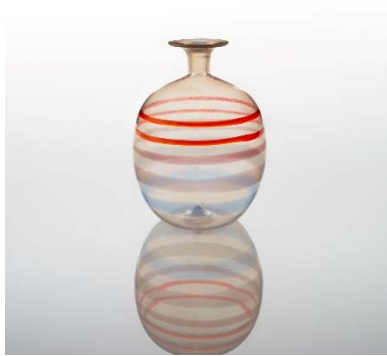
Carlo Scarpa "A Fili" vase, model no. 4540, circa 1942 Estimate: $25,000-35,000