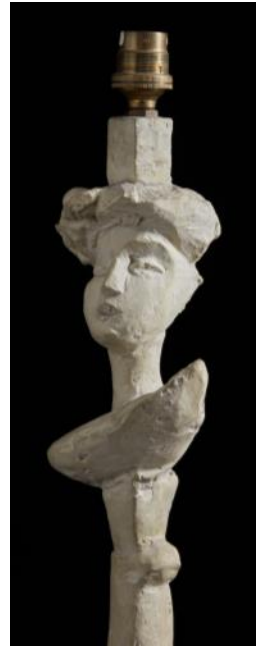
Alberto Giacometti Rare "Ecoissaise" table lamp, circa 1935 Estimate: $100,000-150,000

In recent seasons Phillips has seen particularly strong markets for French designer Jean Royère. In December of 2014, Phillips broke the world auction record for the designer, selling an "Ours Polaire" sofa and pair of armchairs for $842,500. This season Phillips will again offer an iconic "Ours Polaire" sofa and pair of armchairs as two separate lots (illustrated below).