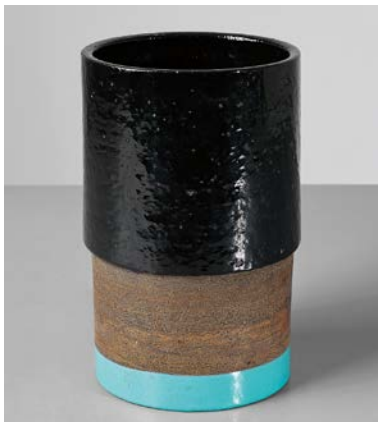
Ettore Sottsass, Jr. Large vase, model no. 389-B, circa 1961 Estimate: $6,000-8,000