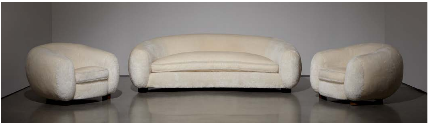
Jean Royère "Ours Polaire" sofa & Pair of "Ours Polaire" armchairs, 1950s Sofa Offered Separately from the Pair of Chairs – each estimated at $300,000, 400,000

Works by Austrian-born potter Lucie Rie have also performed well at auction. Earlier this season, Phillips set a new world record for Rie with the sale of a 1976 conical bowl, which achieved $135,608. The December Evening will offer two important porcelain bowls by Lucie Rie, both circa 1978, one of which has been consigned by the artist's estate (both illustrated page 4, upper right).