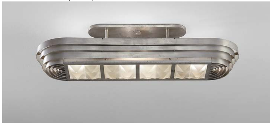
Donald Deskey Ceiling light from the Brown Palace Hotel, Denver, circa 1936 Estimate: $30,000-40,000