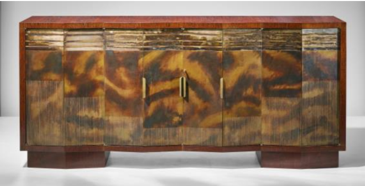
Eugène Printz and Jean Dunand Important sideboard, circa 1927 Estimate: $400,000-500,000

An important sideboard (illustrated below), circa 1927, created jointly by Eugène Printz and Jean Dunand was executed at the inception of Printz's mature style and also marks the beginning of a long collaboration between the two master craftsmen. In addition to the virtuoso woodworking, the sideboard reflects the legacy of the ancien régime through its functionality and innovative use of materials. Printz often integrated ingenious moving components in his furniture, similar to the mechanical furniture from the eighteenth century. The doors of the 1927 sideboard cleverly slide and fold open to stack neatly at the sides. Such features were meticulously designed to achieve the utmost ease of use. The synergy between Printz and Dunand resulted in a progressive iteration of Art Deco that anticipated modern furniture of the following decades.