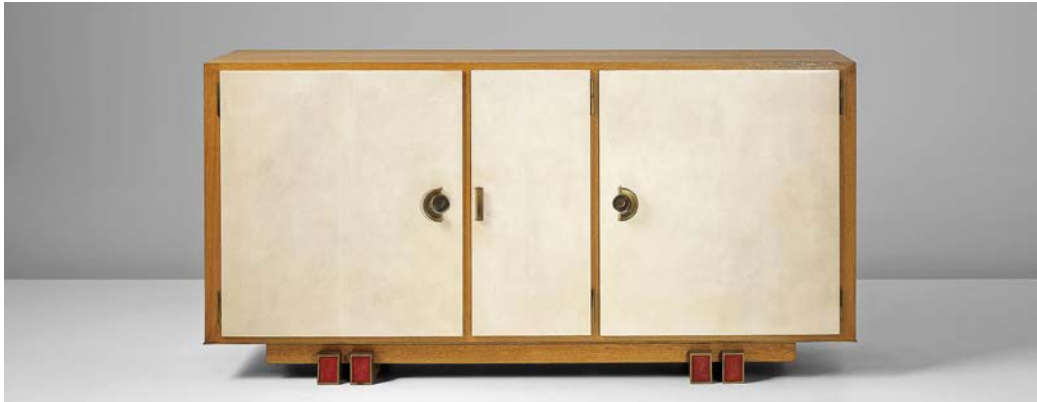
Paul Dupré-Lafon Sideboard, 1940s Estimate: 60,000-80,000