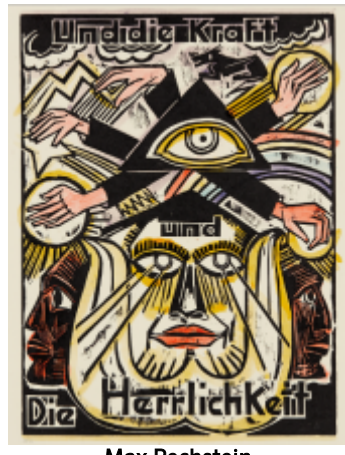
Max Pechstein Das Vater Unser (The Lord's Prayer), 1921 Estimate: $20,000-30,000 *one of twelve illustrated here