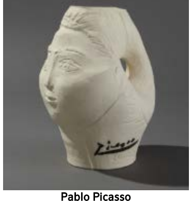
Tête de femme couronnée de fleurs, 1954 Estimate: $20,000-30,000