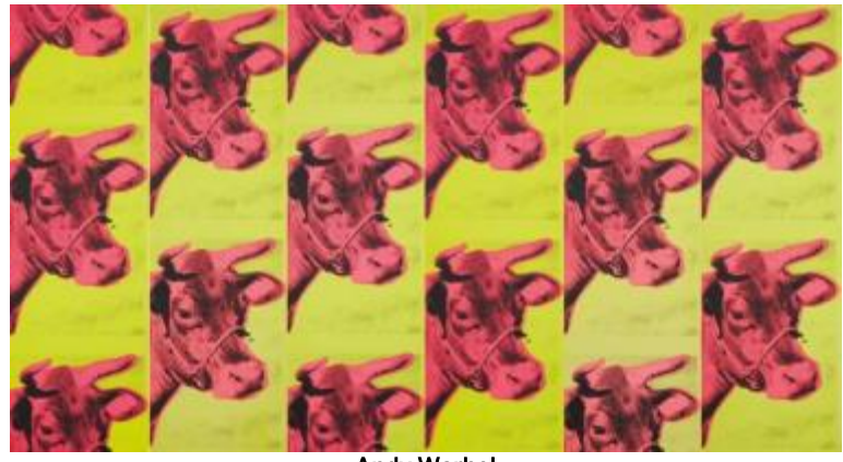
Andy Warhol Cow Wallpaper, Wall panels, 1966 Estimate: $25,000-35,000

Also among the sale's highlights are highly soughtafter iconic Pop images, including Roy Lichtenstein's View from the Window ( illustrated below ) and Andy Warhol's Mickey Mouse . Warhol's Cow Wallpaper ( illustrated left ), also included in the sale, is a six-panel wall installation that hails from the estate of Bill Leonard, director of the Contemporary Arts Center in Cincinnati from 1964-71. In 1966, Leonard organized the Andy Warhol exhibition Holy Cow! Silver Clouds! Holy Cow! , which recreated the artist's show at Leo Castelli Gallery.