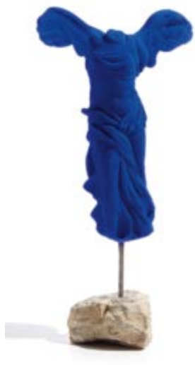
Yves Klein Victoire de Samothrace , 1962 Estimate: $100,000-150,000