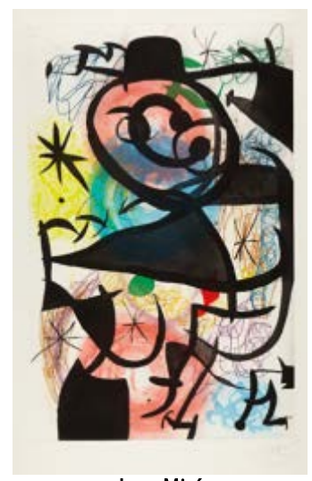
Joan Miró Le pitre rose (Pink Clown), 1974 Estimate: $25,000-35,000