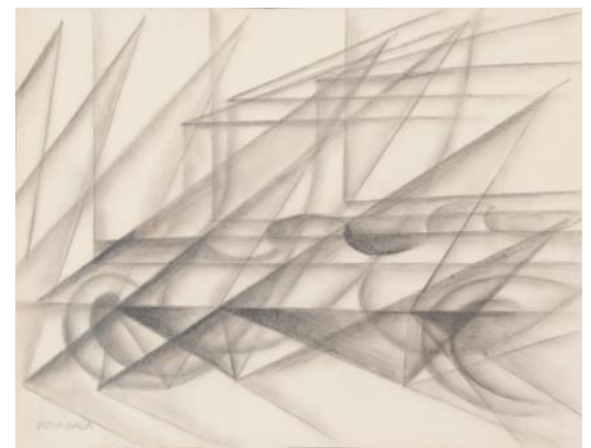
Giacomo Balla 1871-1958 Automobile in corsa - studio , 1913-1914 Estimate: £300,000-400,000

Italian Futurism comes to the fore this March, with museum quality works on paper by Giacomo Balla and Gino Severini. Balla's Automobile in corsa - studio , from 1913-1914, stands amongst his first explorations of Futurism (estimate: £300,000-400,000). The work offers a window into the defining thematic concerns of the early Futurists, which centred on the glorification