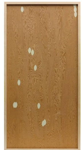
Sherrie Levine b. Parchment Knot: 3, 2003 Estimate: £120,000-180,000

woman's neck where the face would usually be depicted. Using clean lines against a stark background, Condo creates an effect which is both elegant and disturbing, serving to further anthropomorphise the creatures.