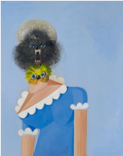
George Condo b. 1957 Jean-Louis' Girlfriend, 2005 Estimate: £150,000-200,000

The 20th Century & Contemporary Art Day Sale on 10 March will be led by George Condo's Jean-Louis' Girlfriend (estimate: £150,000-200,000) and Sherrie Levine's Parchment Knot: 3 (estimate: £120,000-180,000). Alongside these significant works the sale will offer a diverse selection of highly sought after contemporary artists including Gabriel Orozco, Adrian Ghenie, Peter Fischli & David Weiss, Yoshitomo Nara, among others.