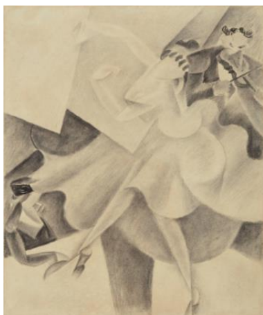
Gino Severini 1883 - 1966 Danseuse et violoniste , 1915 Estimate: £1,200,000-1,800,000