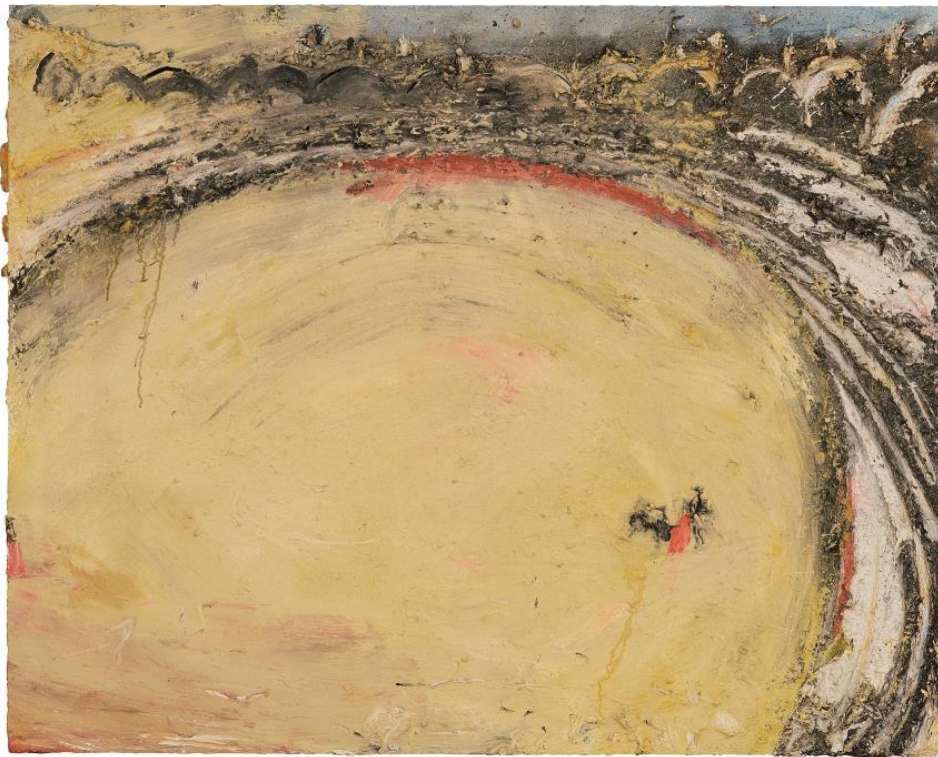
Miquel Barceló b. 1957