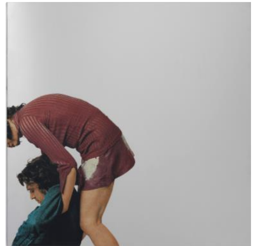
Michelangelo Pistoletto b. 1933 Particolare della deposizione, 1974 Estimate: £500,000-700,000

with their own reflection, viewers are urged to interact with Pistoletto's compositions, forming part of an eternal, improvised performance. The interplay between time and space is investigated through Pistoletto's use of religious iconography, with the present work directly referencing a biblical scene with contemporary figures. Executed at the highest point in the development of the mirror series, Particolare di deposizione demonstrates the artist's mastery of his instantly recognisable technique which has become one of the most iconic series of 20th century art.