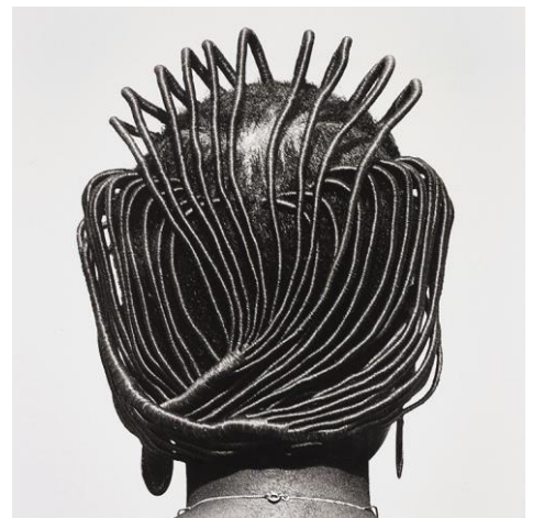
J. D. 'Okhai Ojeikere 1930-2014 Detail from Hairstyles , 1968-1975 Estimate: £30,000-50,000

The final lot in ULTIMATE is J. D. 'Okhai Ojeikere's Hairstyles , a unique polyptych of six photographs taken between 1968-1975 (illustrated right). For over 30 years, Ojeikere photographed Nigerian women's hairstyles for all occasions from the everyday to the ceremonial, creating a visual history that both recalled the past and captured the present. For Ojeikere, Hairstyles , conceived at a time when photographers in Africa did not embark on non-commercial projects, was an artistic and ethnographic celebration of Nigerian culture. The Metropolitan Museum of Art, Art Institute of Chicago and Victoria and Albert Museum hold other works from this series.