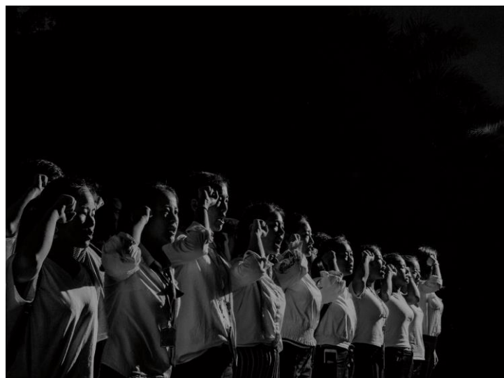
Alex Majoli b. 1971 Scene #1350 , 2017 Estimate: £15,000-25,000

A unique triptych exploring our relationship with the unknown, The Afronauts , 2012 by Cristina de Middel is another work to feature in our Magnum collaboration (illustrated above). Further Magnum highlights include Alex Majoli's monochromatic Scene #1350 , 2017 (illustrated below left), and Newsha Tavakolian's Untitled from Listen , 2010-2011 (illustrated below right). One of six imaginary CD covers, Tavakolian's work was created for Iranian women singers who are not allowed to perform solo or produce their own CDs due to Islamic regulations in place since 1979.