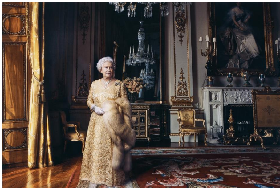
Annie Leibovitz b. 1949 Queen Elizabeth II, The White Drawing Room, Buckingham Palace, London , 2007 Estimate: £30,000-50,000

Phillips looks forward to the sale of Artist | Icon | Inspiration: Women in Photography , an auction on 7 June in New York, presented with gallerist and collector Peter Fetterman that will explore the role of women as artists, subjects, and innovators.