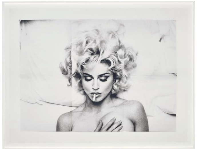
Anne Collier b. 1970 Folded Madonna Poster (Steven Meisel), 2007 Estimate: £20,000-30,000