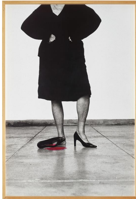
Helena Almeida 1934-2018 Seduzir [Seduce], 2002 Estimate: £50,000-70,000