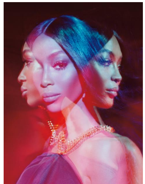
Steven Meisel b. 1954 Naomi Campbell, New York City, 2019 Estimate: £35,000-45,000

Leading ULTIMATE EDITORIAL is Steven Meisel's Naomi Campbell, New York City , 2019, the very image featured on the March 2019 cover of British Vogue . The work captures the creative collaboration between two legends of fashion – image-maker Steven Meisel and supermodel Naomi Campbell – who have defined key moments in our social history and visual culture for over 30 years. Here, through multiple exposure and deliberate blurring, Meisel has created a surreal composition.