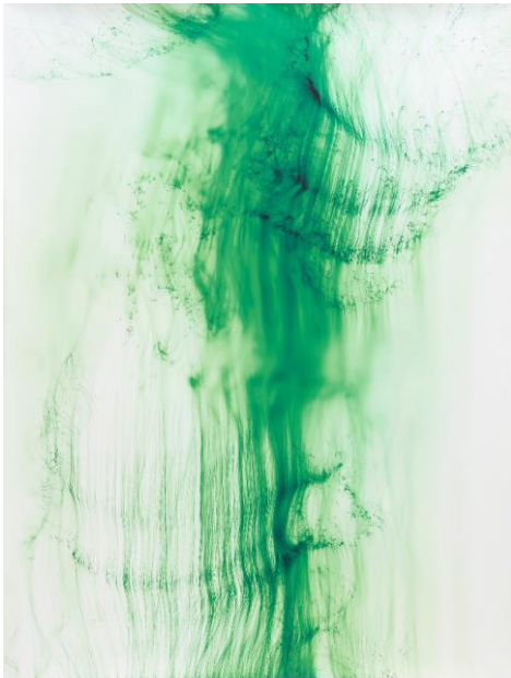
Wolfgang Tillmans b. 1968 Freischwimmer 34 , 2004 Estimate: £150,000-200,000

One of the leading highlights of the 20th Century & Contemporary Art Day Sale is Wolfgang Tillmans' Freischwimmer 34 (illustrated below left), a photographic work showcasing Tillmans' exploration of non-representational photography, creating abstract and distorted images designed to push the limits of visibility and causing the viewer's gaze to 'swim'. A sculptural highlight from the Day Sale is Lynn Chadwick's First Girl Sitting On Bench (illustrated below centre). In this angular composition Chadwick navigates not only physical form, through the use of metal structures, but also the mental sphere of his subject, through her contemplative pose. A further highlight is Günther Förg's Untitled , which belongs to his iconic series of lead paintings created throughout the 1980s and early 1990s. Through his composition of a slate grey background washed with white and bisected by a solitary electric blue stripe, Förg encourages us to admire the intensity of the metallic material itself. The resulting work is a harmonious dialogue between depth and dimensionality.