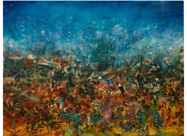
Ali Banisadr b. 1976 Nowhere , 2010 Estimate: £260,000-360,000

The Evening Sale champions a rich diversity of international names from the contemporary scene, including Ali Banisadr's Nowhere , 2010 (illustrated right). The composition of Nowhere hangs between figuration and abstraction; glimpses of forms, figures, flora and fauna emerge from the multitude of intricate brushstrokes that cultivate the surface of the canvas. Also on offer is Untitled , 2006 by Amy Sillman, who is soon to be celebrated at the Camden Arts Centre, London, in her forthcoming 2018 solo exhibition (estimate: £150,000-200,000). Other works include Lynette Yiadom-Boakye's Marble , 2010 (estimate: £150,000-200,000), Avery Singer's Ihole , 2011 (estimate: £40,000-60,000), and Cheyney Thompson's Chronochrome set 1 , 2010 (estimate: £150,000-250,000).