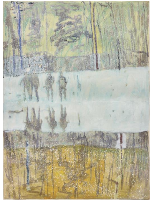
Peter Doig b. 1959 Cobourg 3+1 more , 1995 Estimate: £700,000-900,000

The Evening Sale champions a rich diversity of international names from the contemporary scene, including Ali Banisadr's Nowhere , 2010 (illustrated right). The composition of Nowhere hangs between figuration and abstraction; glimpses of forms, figures, flora and fauna emerge from the multitude of intricate brushstrokes that cultivate the surface of the canvas. Also on offer is Untitled , 2006 by Amy Sillman, who is soon to be celebrated at the Camden Arts Centre, London, in her forthcoming 2018 solo exhibition (estimate: £150,000-200,000). Other works include Lynette Yiadom-Boakye's Marble , 2010 (estimate: £150,000-200,000), Avery Singer's Ihole , 2011 (estimate: £40,000-60,000), and Cheyney Thompson's Chronochrome set 1 , 2010 (estimate: £150,000-250,000).