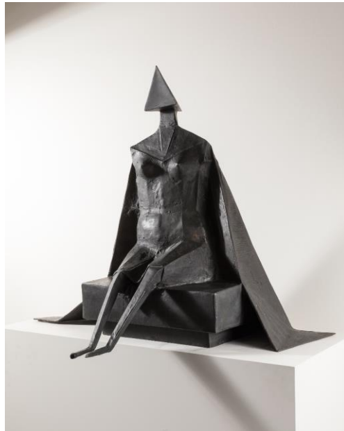
Lynn Chadwick, R.A. 1914-2003 First Girl Sitting On Bench , 1988 Estimate: £220,000-280,000