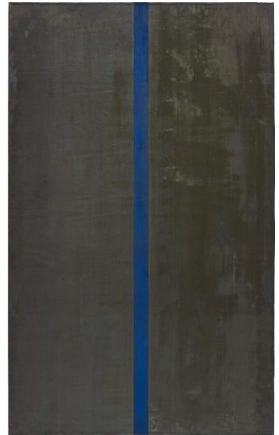
Günther Förg 1952-2013 Untitled , 1992. Estimate: £150,000-200,000