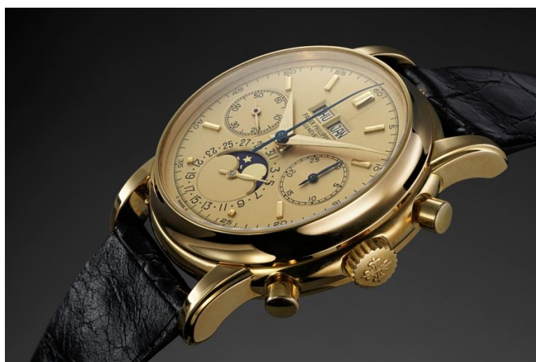
Patek Philippe, Reference 2499 Estimate: CHF 800,000-1,600,000

World Tour in Hong Kong, Singapore, Los Angeles, London, New York and Geneva