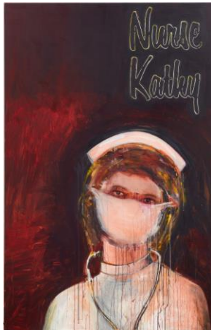
RICHARD PRINCE b. 1949, Nurse Kathy , 2006-2008 Estimate: HKD 31,000,000 - 41,000,000

Led by a Global Icon of Post-Modern Art Nurse Kathy by Richard Prince