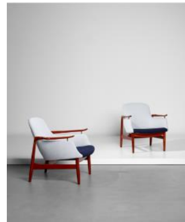
FINN JUHL (1912 - 1989) Pair of chairs, model no. FJ 45, circa 1953 Estimate: HKD 250,000 - 350,000