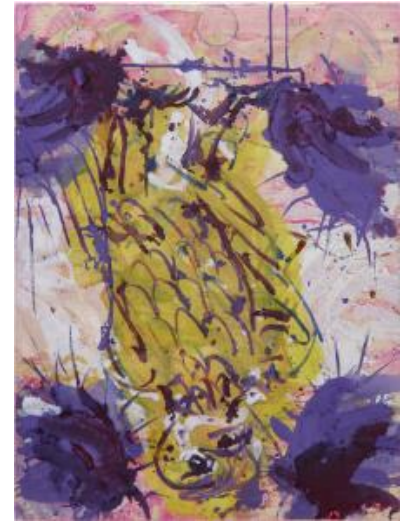
GEORG BASELITZ b. 1938 Hinterglasvogel , 1997 Estimate: HKD 2,000,000 - 3,000,000

The End was included in Cecily Brown's major solo retrospective at the Museum of Fine Art Boston in 2006 (estimate: HKD 4,000,000 - 6,000,000, illustrated above centre ). Created during a crucial period in Brown's career, when she began to draw influence from the formal genres of Old Master paintings, The End faintly recalls lavish banquet still-life paintings of the 17th century. Brown's layered gestural strokes, intimating at discarded forks, and blocks of meat, immediately draw on one's sense of touch, taste and smell. The End calls to mind 'the end' of a bacchanal feast, and encapsulates both the stunning technical aptitude, and rigorous intellect that makes Brown one of the most important painters of her generation.