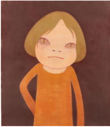
YOSHITOMO NARA b.1959 Not Now, 2003 Estimate: HKD 6,000,000 - 8,000,000

Building on Phillips' record-setting successes across London, New York, and Hong Kong, on offer is a breadth of works by a series of in-demand international artists. The Hong Kong sale will feature Bird House , an intimate landscape by the highly sought-after painter Peter Doig , for whom the house set a new auction record for a living British artist (estimate: HKD 600,000 - 800,000). A highlight of the photography category is Lighter, Green I by German photographer Wolfgang Tillmans (estimate: HKD 400,000 - 600,000). Other important contemporary voices include a painting by Tokyo-based Tomoo Gokita , a sculpture and a painting by KAWS , and one of the largest works on paper that has come to the market Yoshitomo Nara's , Not Now (estimate: HKD 6,000,000 - 8,000,000, illustrated left ). Following a series of popular exhibitions across the globe, the market for Yayoi Kusama is going from strength to strength. Also on offer is Abode of Heart , a sewn soft sculpture that rarely appears on the auction market (estimate: HKD 2,800,000 - 3,800,000, illustrated below right ).