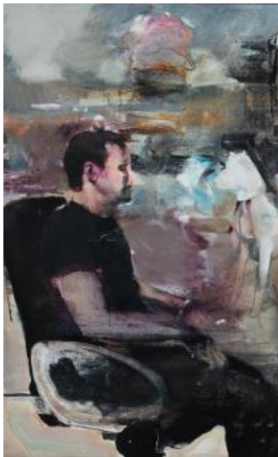
ADRIAN GHENIE b. 1977 Self-portrait as a Monkey , 2010 Estimate: HKD 6,000,000 - 8,000,000

Georg Baselitz is known for his inversion technique, exemplified in Hinterglasvogel (estimate: HKD 2,000,000 - 3,000,000, illustrated above right ). By deliberately upending an image, the artist intends to objectify the work of art without entering the realm of pure abstraction. Upon first glance, the canvas has a multi-layered background, built up through gestural brushwork and vivid purple, white and yellow tones. Yet by rotating the canvas 180 degrees, the lines and colours evolve into an instantly recognisable form - a bird, likely an eagle, a former symbol of German imperialism.