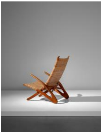
HANS J. WEGNER (1914 - 2007) Rare 'Dolphin' folding armchair, model no. JH510, designed 1950 Estimate: HKD 750,000 - 1,200,000