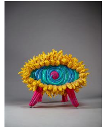
YAYOI KUSAMA b.1929 Abode of Heart, 2012 Estimate: HKD 2,800,000 - 3,800,000

The auction also includes the work of French-Japanese painter Léonard-Tsuguharu Foujita . Reclining Nude is a sinuous depiction of the female form, showcasing the artist's mastery of classical Western painting techniques, whilst incorporating a traditional Japanese aesthetic (estimate: HKD 3,000,000 - 5,000,000). First generation Gutai artists remain highly sought after and the Evening Sale will include representative paintings by two other distinguished members, including Atsuko Tanaka's 2001-F , from her celebrated series of interconnected orb paintings (estimate: HKD 6,000,000 - 3,500,000), alongside Sadamasa Motonaga's Yon Kuru (estimate: HKD 1,300,000 - 2,300,000).