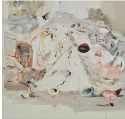
CECILY BROWN b. 1969 The End , 2006 Estimate: HKD 4,000,000 - 6,000,000

Young Girl with Blue Dress was painted in 2007 and showcases one of George Condo's unmistakable muses (estimate: HKD 3,000,000 - 5,000,000, illustrated above left ). With her face constructed from a mysterious, colourful agglomeration of forms stacked one atop the other, with one eye goggling and the teeth of her upper mouth displaced in a crazed grin, this picture is filled with the unique energy that informs many of Condo's greatest paintings.