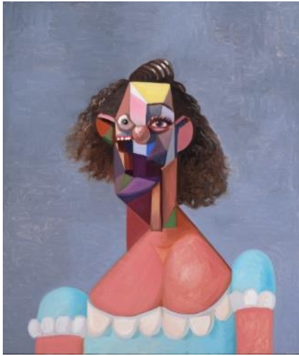
GEORGE CONDO b. 1957 Young Girl with Blue Dress , 2007 Estimate: HKD 3,000,000 - 5,000,000

Young Girl with Blue Dress was painted in 2007 and showcases one of George Condo's unmistakable muses (estimate: HKD 3,000,000 - 5,000,000, illustrated above left ). With her face constructed from a mysterious, colourful agglomeration of forms stacked one atop the other, with one eye goggling and the teeth of her upper mouth displaced in a crazed grin, this picture is filled with the unique energy that informs many of Condo's greatest paintings.