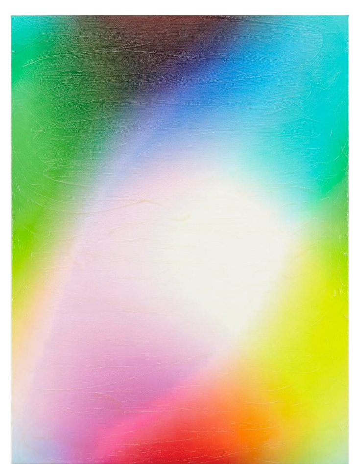
PARKER ITO Details - gradient - screensaver 3.0.jpg, 2010 Estimate $15,000-20,000