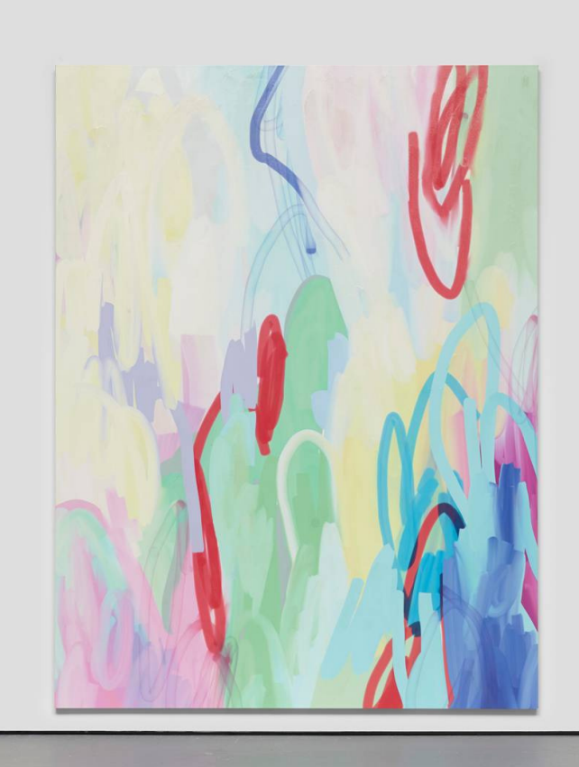
MICHAEL MANNING Untitled, 2014 Estimate $10,000-15,000