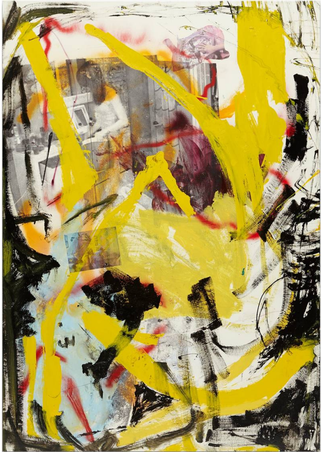
LEO GABIN French Braid Tutorial, 2013 Estimate $15,000-20,000