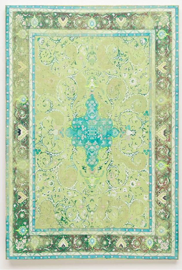
KOUR POUR Untitled, 2012-13 Estimate $30,000-40,000

Parker Ito is known for being at the forefront of this movement and this sale is populated by three of the artist's most interesting works; The Agony and the Ecstasy (23) a 2012 "scotchlite" wherein the artist has created a "painting" that looks different in person than it does in photographs, calling into question how art images circulate in a digital age; Memoirs of an Imperfect Kawaii Trill BB 11 , 2013 the first sculpture by the artist to appear at auction and Details – gradient – screensaver 3.0.jpg from a 2010 series that is likewise the first example to be sold in an auction.