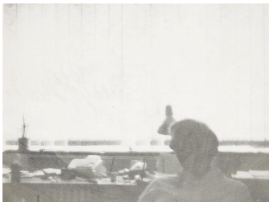
SIGMAR POLKE Ohne Titel/Untitled, from Medium Fotografie/The Medium of Photography, 1984