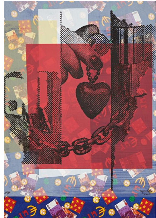
SIGMAR POLKE S.H. Oder die Liebe Zum Stoff/S.H. or the Love of Fabric, 2000