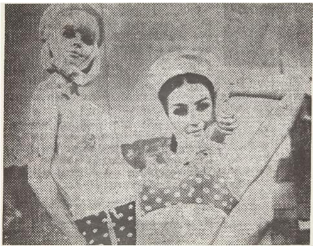
SIGMAR POLKE Freundinnen I/Girlfriends I , 1967

Polke often employed his own photography both as medium and source, beautifully exemplified in Ohne Titel (Medium Fotografie) , 1984. This unique black and white photograph depicts a mysterious form resembling a bunny in a windowsill and was an important contribution to the photographic portfolio Medium Fotografie . Each example from the edition of 21 is a unique print, varying in composition and affects. A series of the artist's photographs of the model Mariette Althaus, translated into offset lithographs in Weekend I, II, and III , 1971-72 is also offered as the complete set of three.