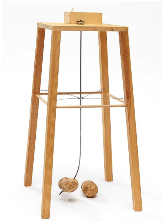
SIGMAR POLKE Apparat, mit dem eine Kartoffel eine andere umkreisen kann/Apparatus Whereby One Potato Can Orbit Another, 1969

Polke said of his art making: "There has to be an element of risk-taking for me in my work." This show is consequently boldly presented and displayed in chronological order, issued with a newspaper fold-out catalogue, and decorated in Polka dots. A time capsule of the late twentieth century, with a freshness and strangeness that holds true decades later, this exciting show demands to be seen and collected.