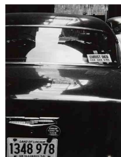
ROBERT FRANK Chicago, 1956 EST $15,000-25,000