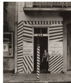
WALKER EVANS Sidewalk and Shopfront, New Orleans, 1935 EST $18,000-22,000

This sale will be immediately followed by the Phillips Photographs various-owners sale.