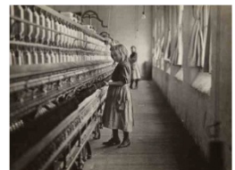
LEWIS WICKES HINE