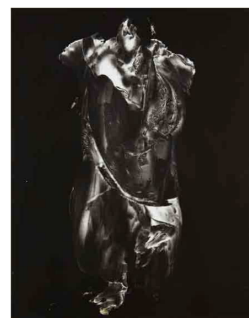
FREDERICK SOMMER Paracelsus, 1960 EST $15,000-20,000