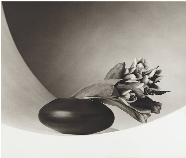
ROBERT MAPPLETHORPE Tulips, 1987 Estimate $70,000-90,000