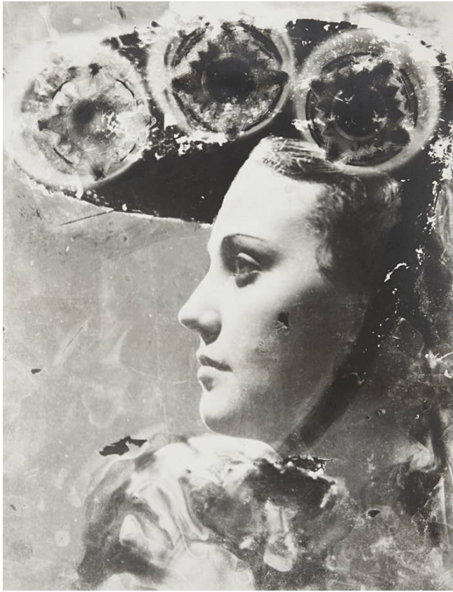
DORA MAAR Profile portrait with glasses and hat, 1930s Estimate $80,000-120,000