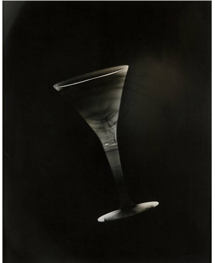
LÁSZLÓ MOHOLY-NAGY Untitled, 1939-1941 Estimate $70,000-90,000