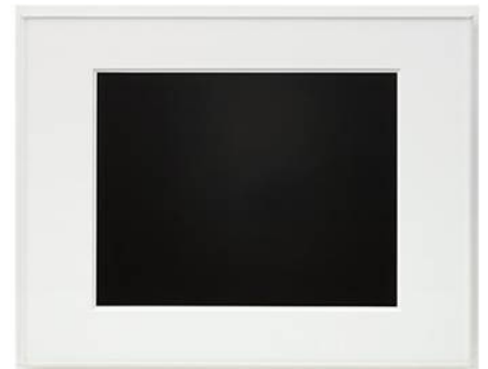
HIROSHI SUGIMOTO Tyrrhenian Sea, Mount Polo (Morning, day, night), 1993 Estimate $150,000-200,000