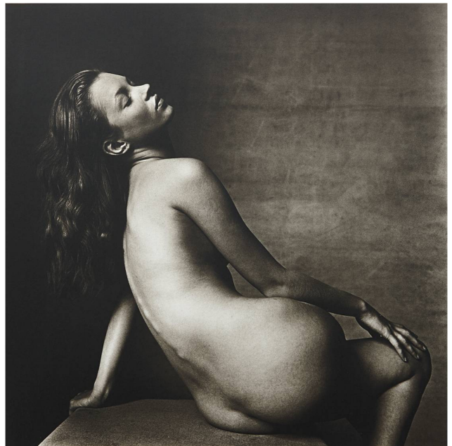
IRVING PENN Kate Moss, New York, 1996 Estimate $70,000-90,000