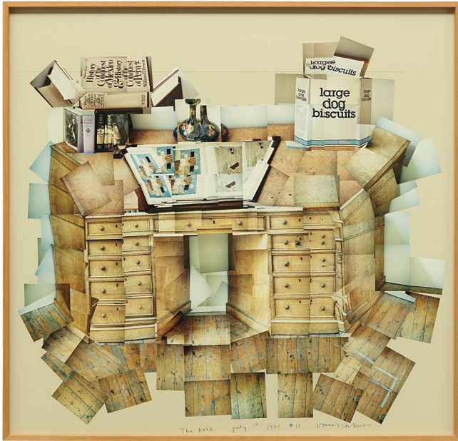
DAVID HOCKNEY The Desk, July 1 st , 1984 Estimate $60,000-80,000