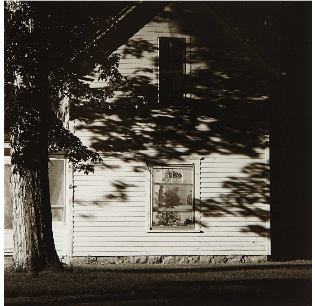
ROBERT ADAMS Berthoud, Colorado, 1968 Estimate $30,000-50,000