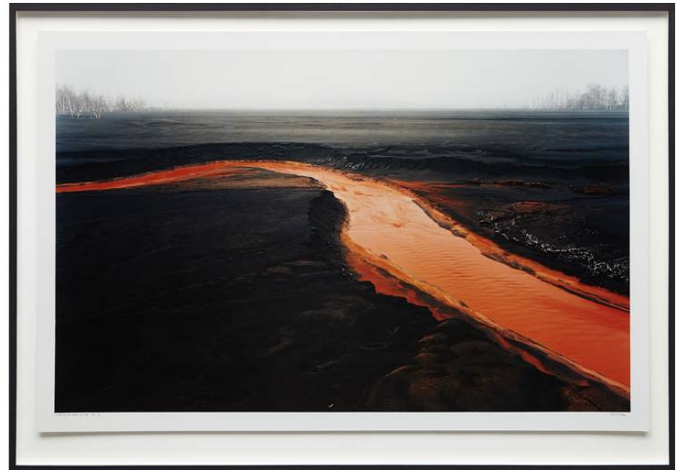
EDWARD BURTYNSKY Nickel Tailings #34 and #35, Sudbury, Ontario, 1996 Estimate $40,000-60,000