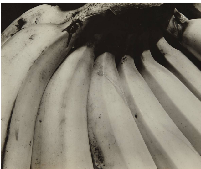
EDWARD WESTON Bananas, 1930 Estimate $70,000-90,000

Pablo Picasso; and Sally Mann's Candy Cigarette , 1989, estimated $80,000-120,000, portraying the tensions and pretenses belying the seemingly smooth surface of childhood.