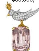
A Kunzite, Diamond and Ruby 'Bird on a Rock' Brooch SCHLUMBERGER FOR TIFFANY & CO. ($20,000-$30,000)