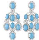
An Impressive Pair of Turquoise and Diamond Ear Pendants ($20,000-$30,000)