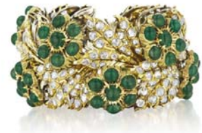
A Unique Diamond, Emerald and Gold Bracelet BUCCELLATI 1970, ($50,000-$70,000)