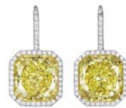
An Important Pair of Fancy Intense Yellow Diamond Ear Pendants ($245,000-$280,000)